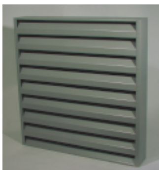
LAAC 15 Acoustic Louvre.