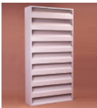
LAAC 30 Acoustic Louvre.