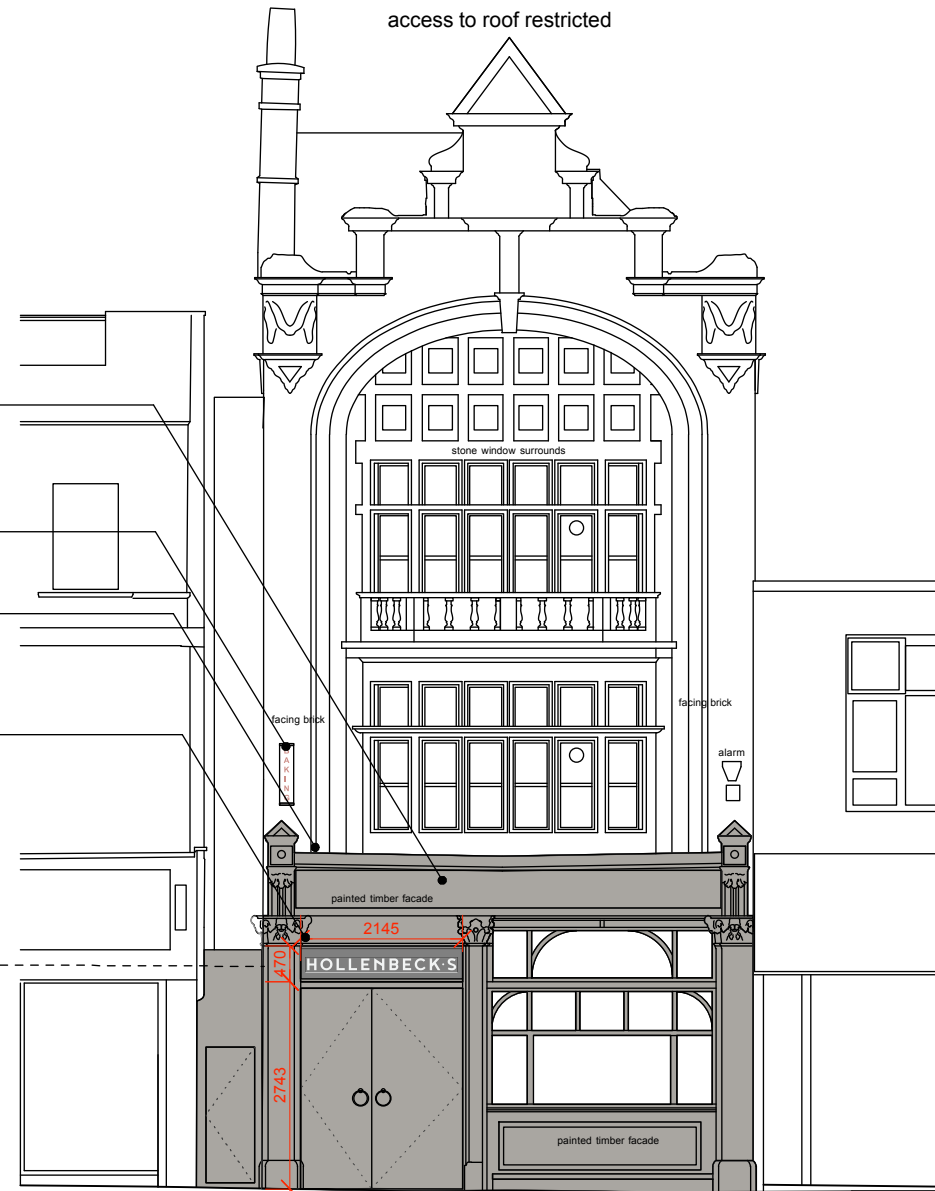
PROPOSED FRONT ELEVATION (SIGNAGE)