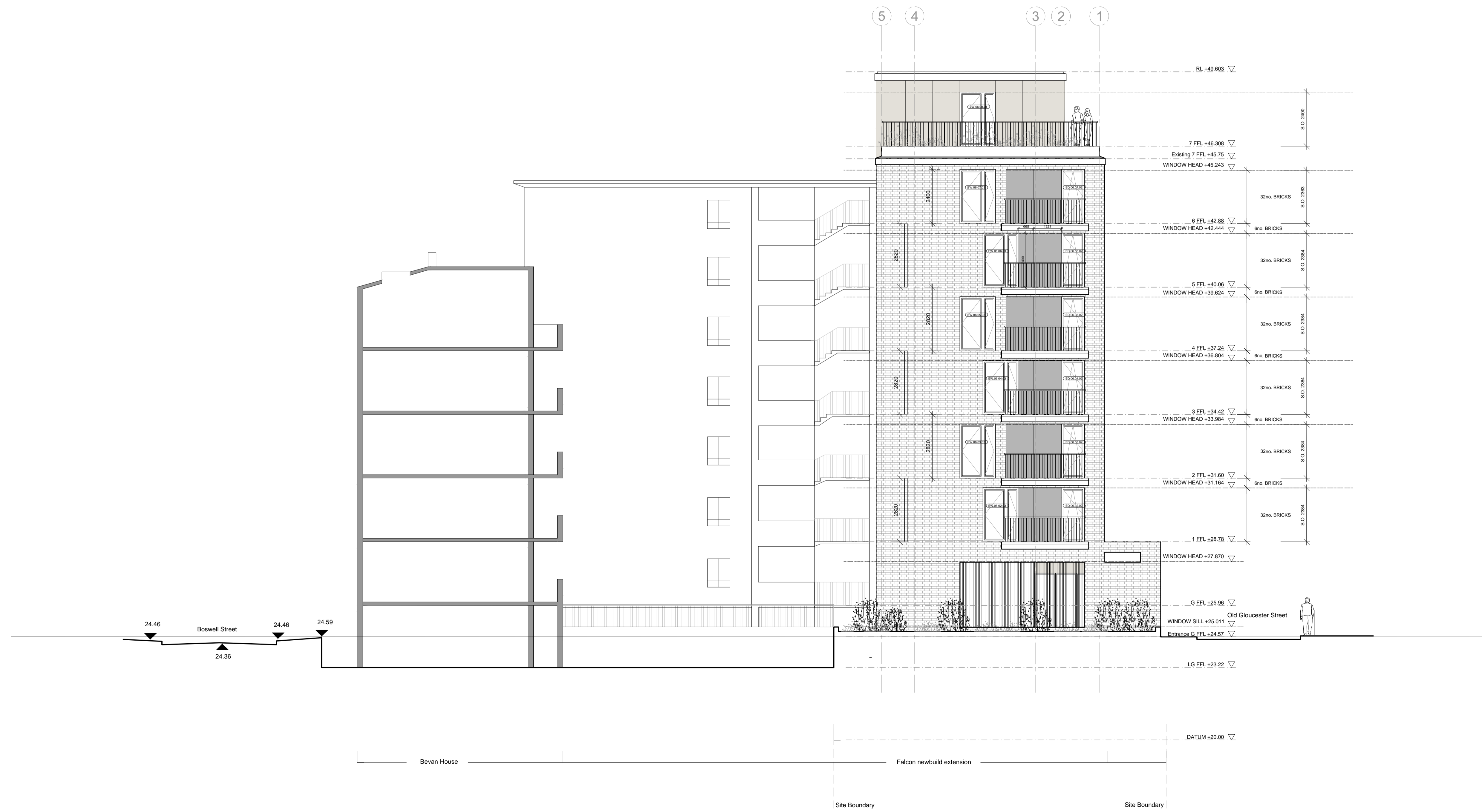
NW Elevation to playground

© Avanti Architects Ltd www.avantiarchitects.co.uk 361-373 City Road + 44 (0) 20 7278 3060 London EC1V 1AS aa@avantiarchitects.co.uk