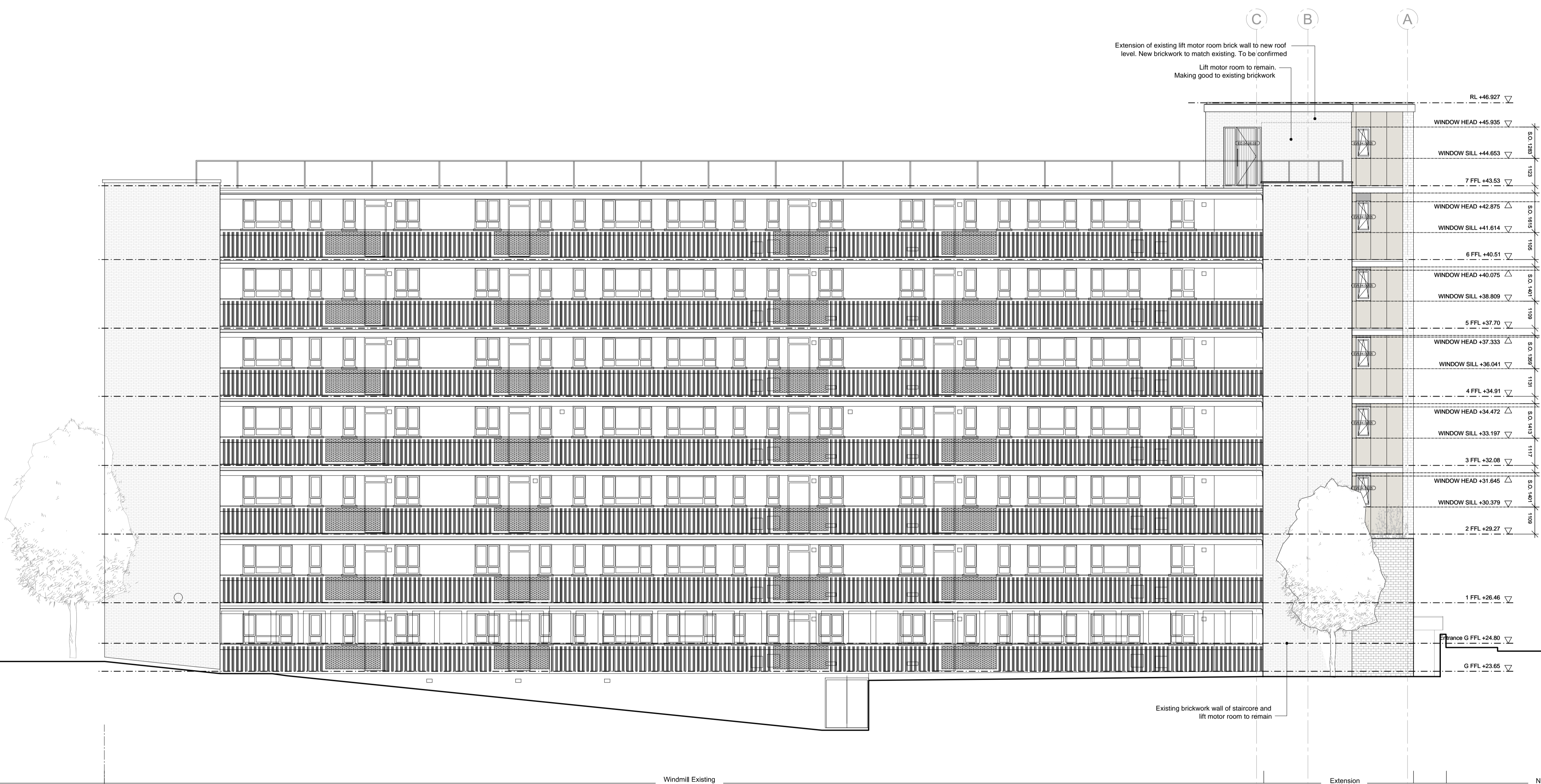
NW Elevation to Courtyard

© Avanti Architects Ltd www.avantiarchitects.co.uk 361-373 City Road + 44 (0) 20 7278 3060 London EC1V 1AS aa@avantiarchitects.co.uk