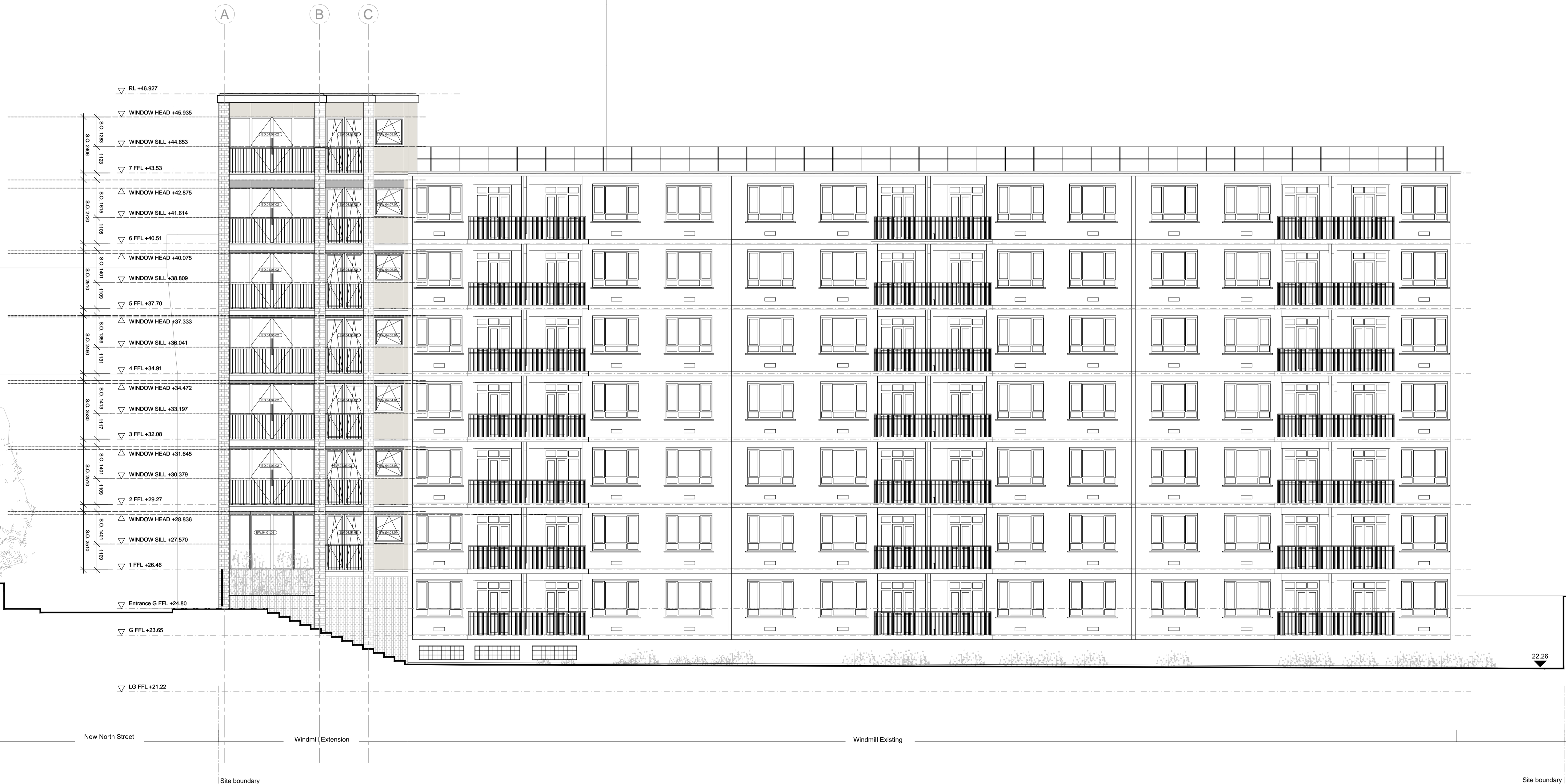
SE Elevation to Warner House

© Avanti Architects Ltd www.avantiarchitects.co.uk 361-373 City Road + 44 (0) 20 7278 3060 London EC1V 1AS aa@avantiarchitects.co.uk