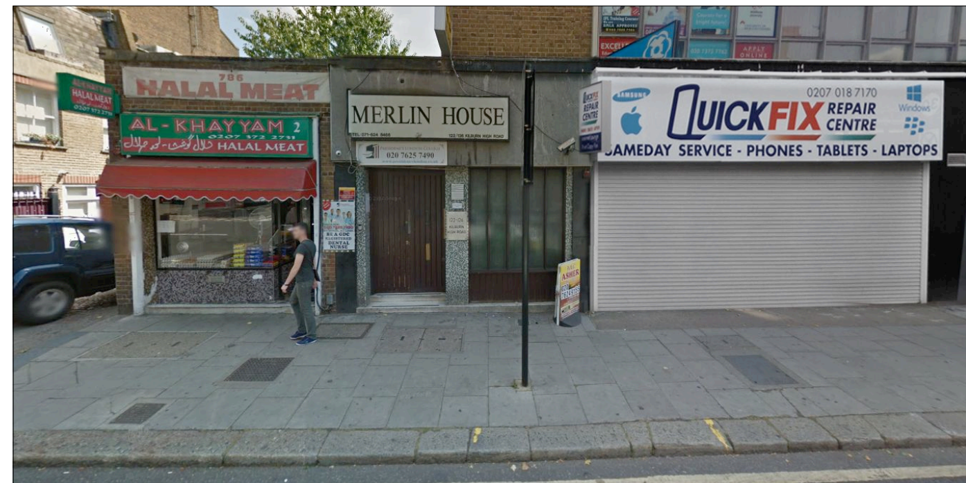
03 1416 (PL)13-02 EXISTING ENTRANCE DOOR SIGN ELEVATION