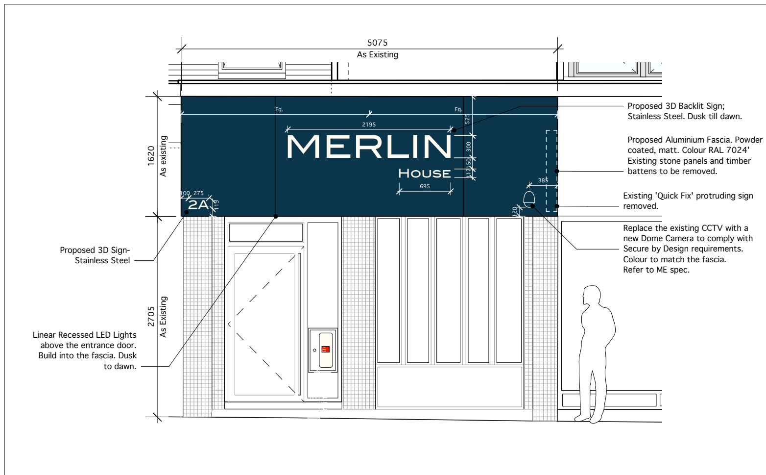
01 1416 (PL)13-02 PROPOSED ENTRANCE DOOR SIGN ELEVATION - QUEX ROAD