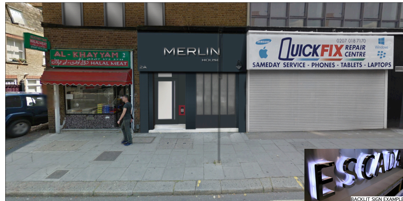
04 1416 (PL)13-02 PROPOSED ENTRANCE DOOR SIGN MONTAGE

© Copyright Stephen Davy Peter Smith Architects 2016 General Notes These proposals are subject to the approval of all Statutory Building Control Requirements and the requirements of all Statutory Authorities and Service Providers. The site boundaries and surroundings are based on a survey carried out by KND Surveyors. The site boundaries are those described by the client. These drawings are to be read in conjunction with all other relevant documentation produced by Stephen Davy Peter Smith Architects and other consultants employed by the client.