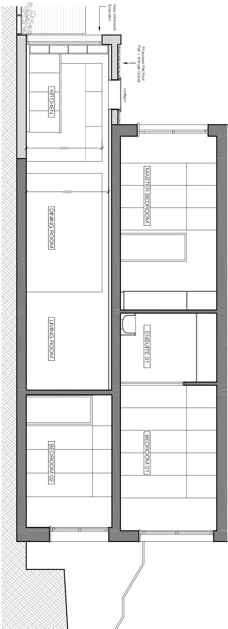
PROPOSED SECTION B-B SCALE 1:50@A3 PA-05