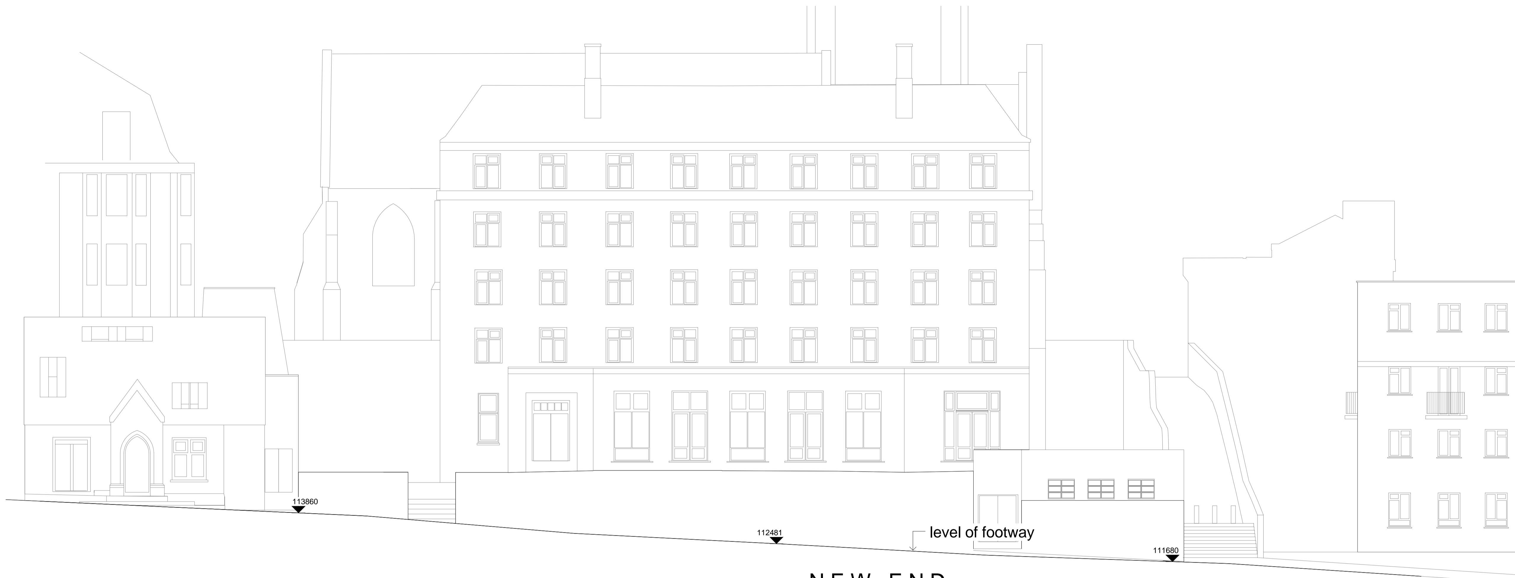
NEW END South - Existing Levels at boundary