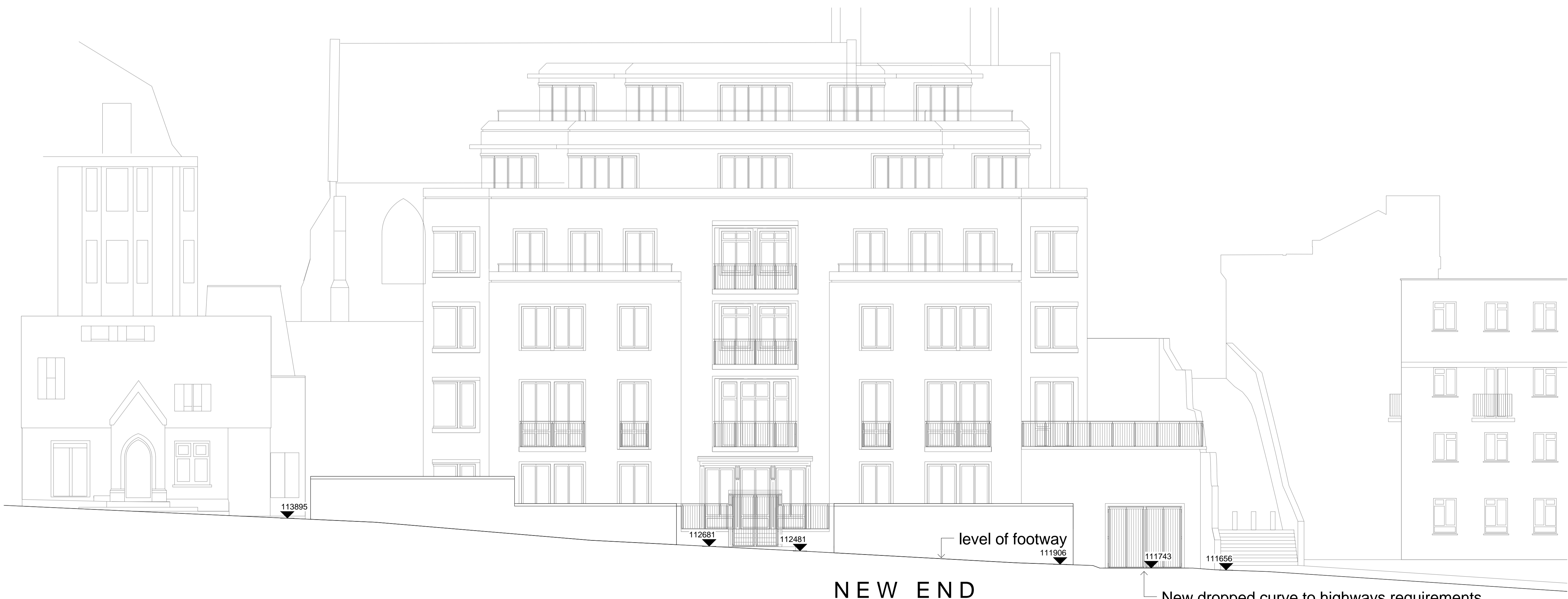
NEW END South - Proposed Levels at boundary New dropped curve to highways requirements