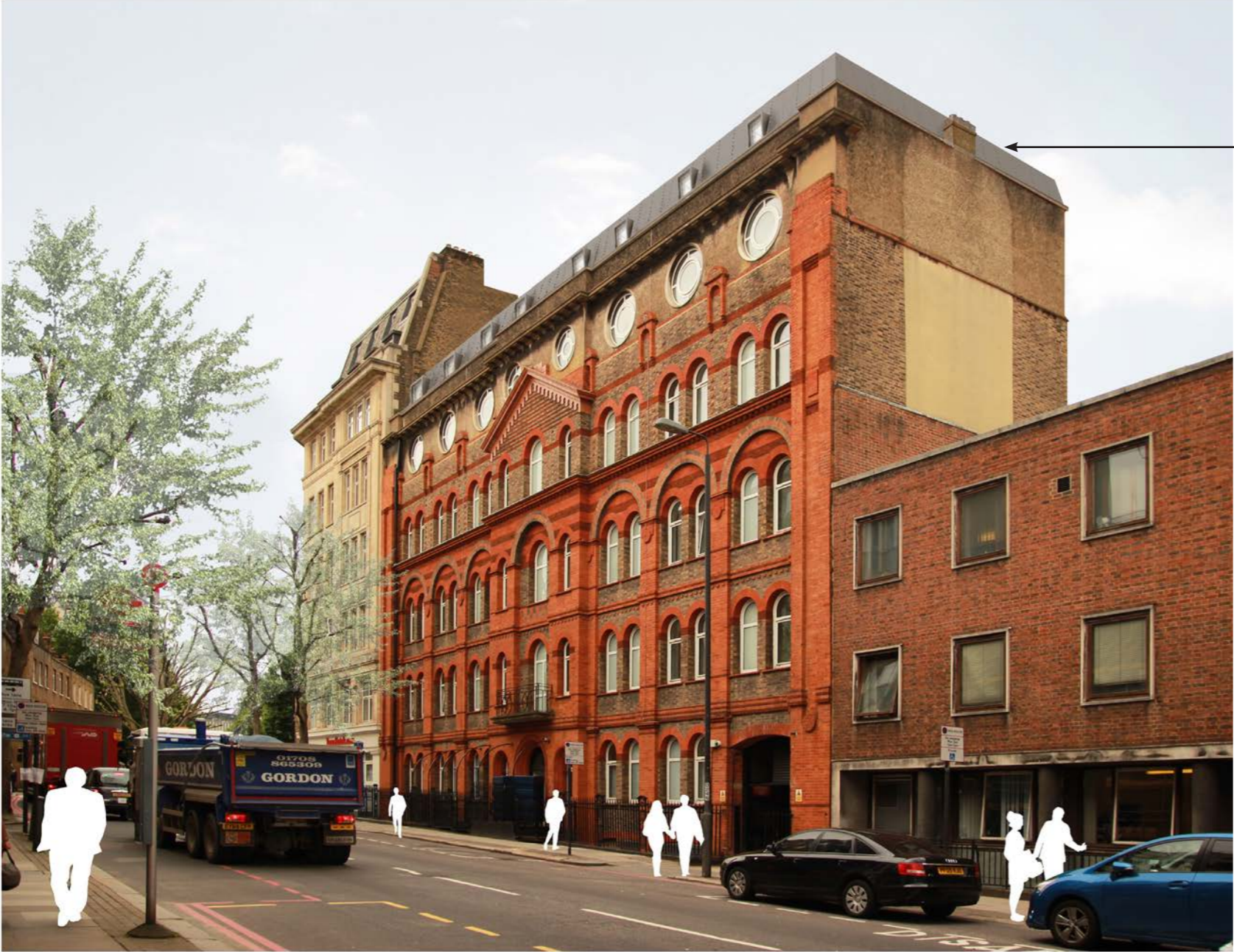
Proposed Swinton Street view