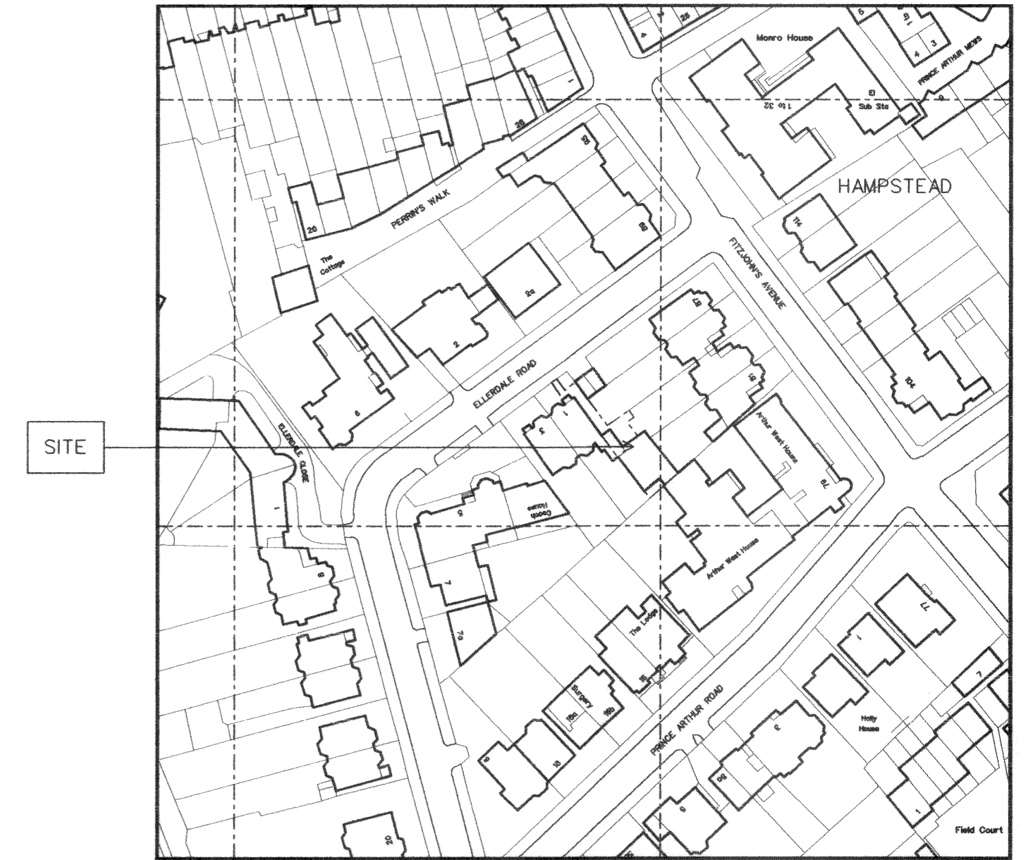
Site Location SCALE 1:1250