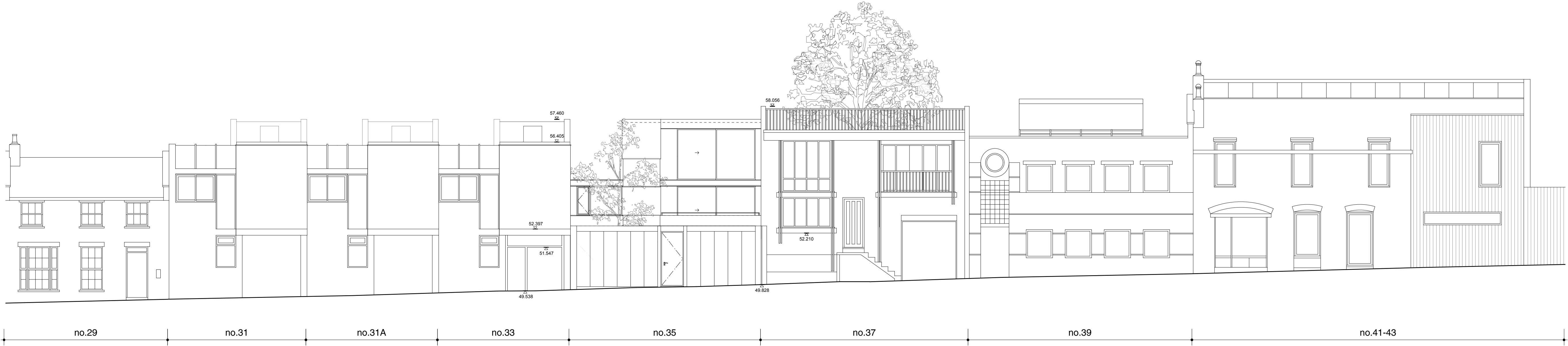
2 Proposed Front Elevation 1:100@ A1