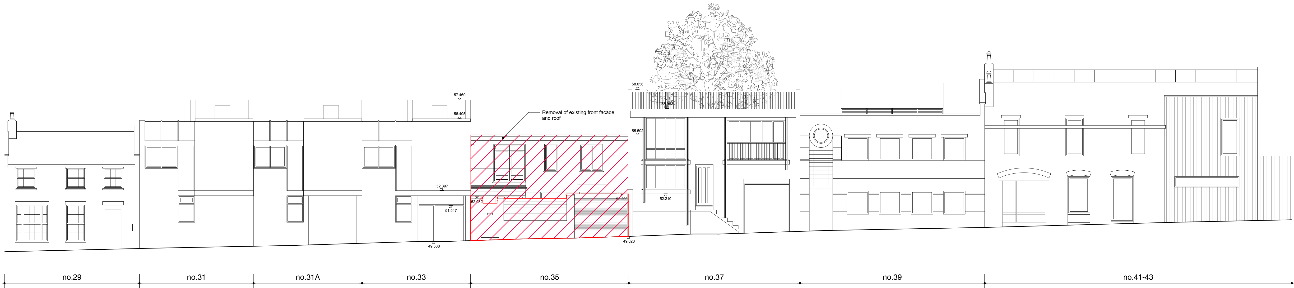
1 Existing Front Elevation 1:100@ A1