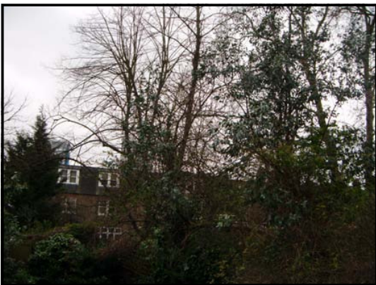
5. View of neighbouring property in No. 101