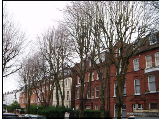
2. View of front