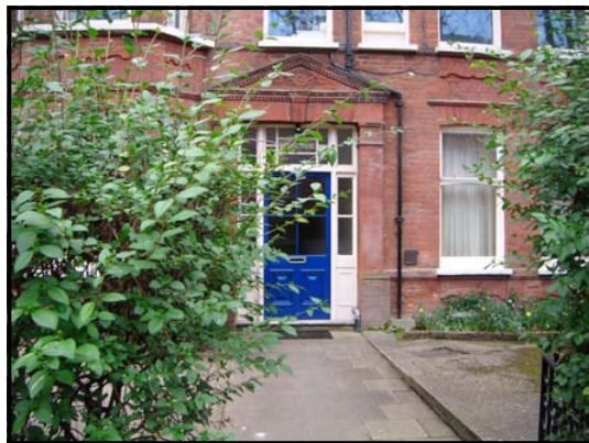
6. H1 Privet