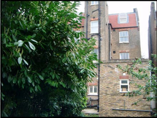
3. View of rear