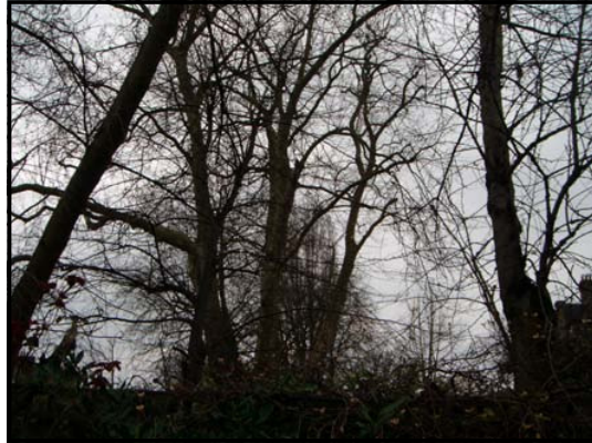
4. View through Limes G3 to London Plane T4