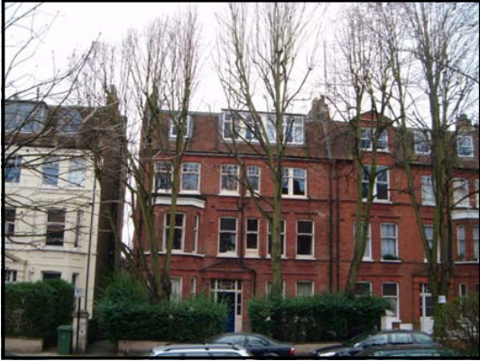
1. View of front