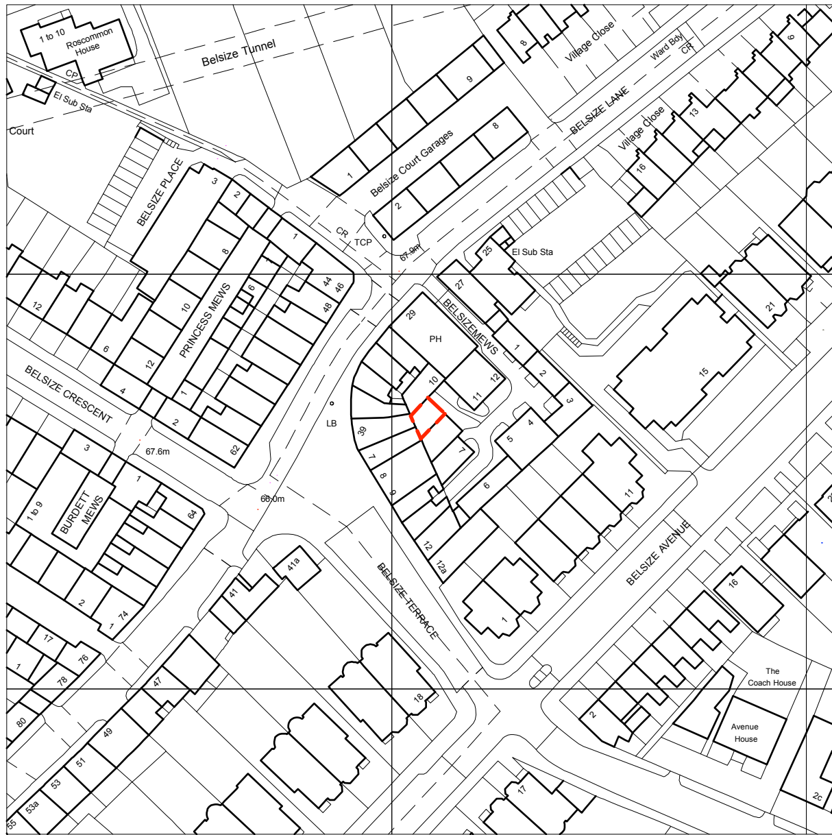
SITE PLAN @ 1:1250