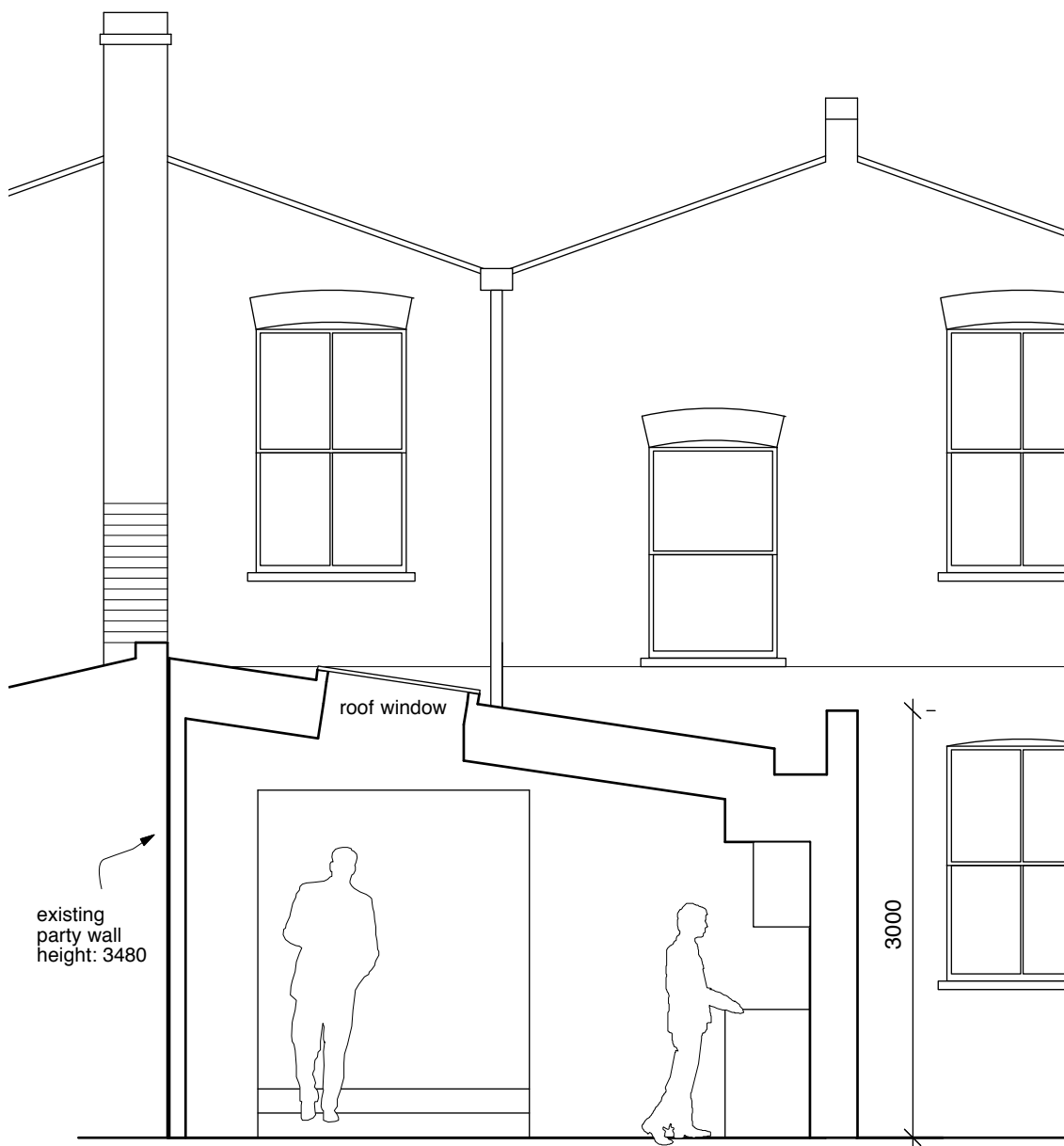
CROSS-SECTION THROUGH EXTENSION

Do not scale from this drawing. Dimensions are to be verified on site prior to construction. Notes