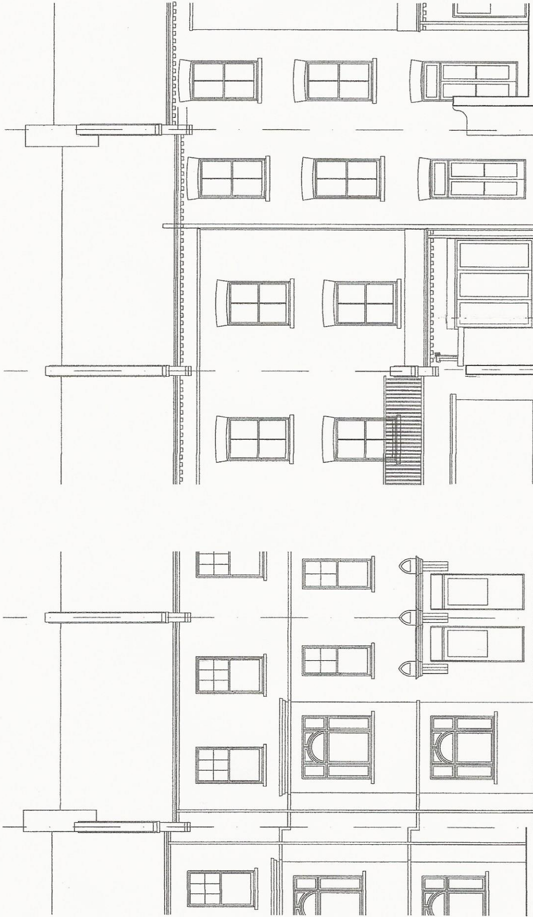
No101. Front Elevation Front Elevation

DO NOT SCALE FROM THIS DRAWING. CHECK ALL DIMENSIONS ON SITE. IF INFORMATION IS NOT CLEAR OR CONSISTANT CONSULT ARCHITECT. THIS DRAWING IS COPYRIGHT.