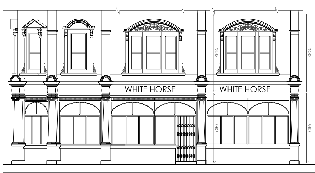
02- EXISTING CONSTANTINE ROAD PART ELEVATION