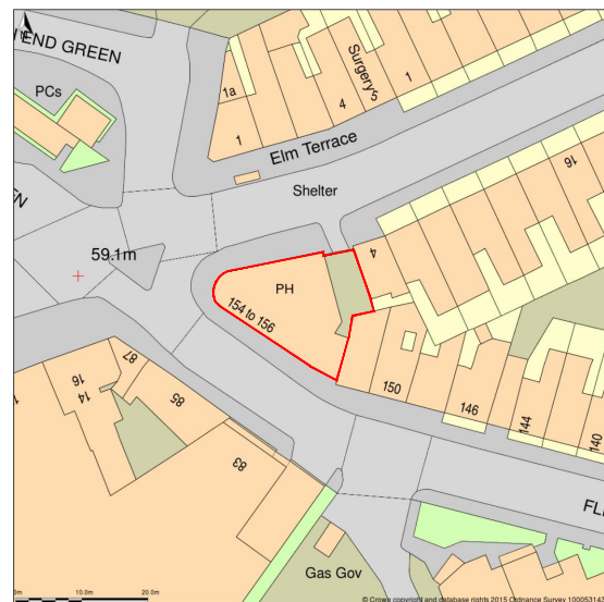
04- OS MAP SCALE- 1:1250