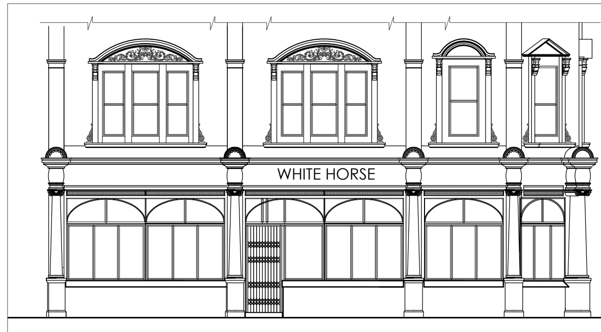
05- EXISTING FLEET ROAD PART ELEVATION

DESIGN ENDEAVOURS 03 BENHAM GARDENS, LONDON, TW4 5JZ M: 07824773079 E: design.endeavour@gmail.com