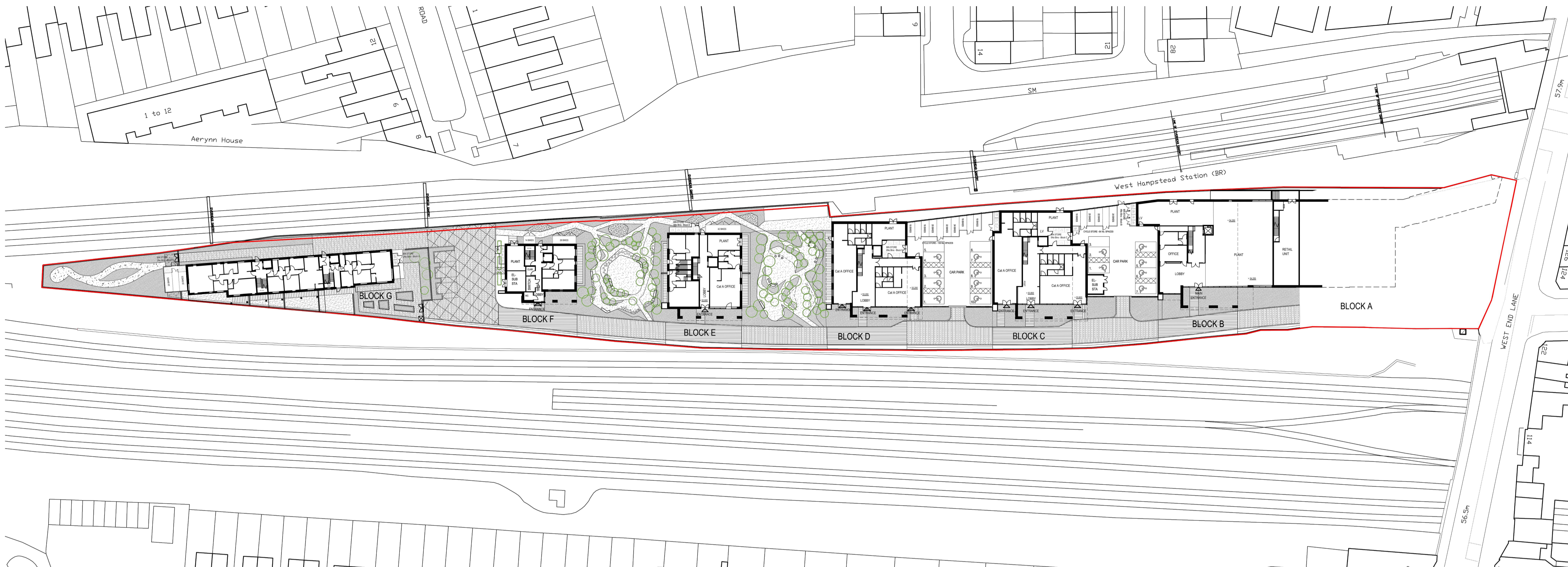
APPROVED SITE MASTERPLAN LOWER LEVEL - DRAWING PL-20 REV B