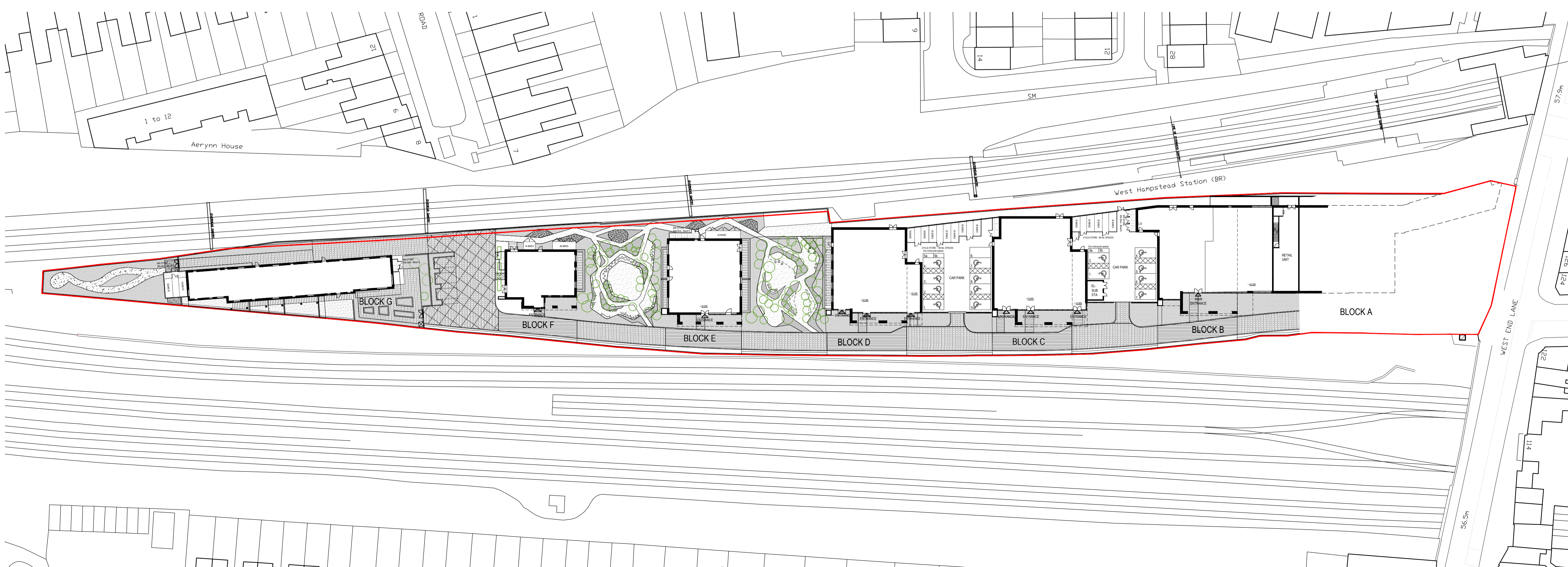
PROPOSED SITE MASTERPLAN LOWER LEVEL

© WCEC ARCHITECTS - DISCLAIMER: This drawing is copyright and shall not be reproduced nor used for any other purpose without the written permission of the Architects. This drawing must be read in conjunction with all other related drawings and documentation. It is the contractors responsibility to ensure full compliance with the Building Regulations. Do not scale from this drawing, use figured dimensions only. It is the contractors responsibility to check and verify all dimensions on site. Any discrepancies to be reported immediately. IF IN DOUBT ASK. Materials not in conformity with relevant British or European Standards/Codes of practice or materials known to be deleterious to health & safety must not be used or specified on this project.