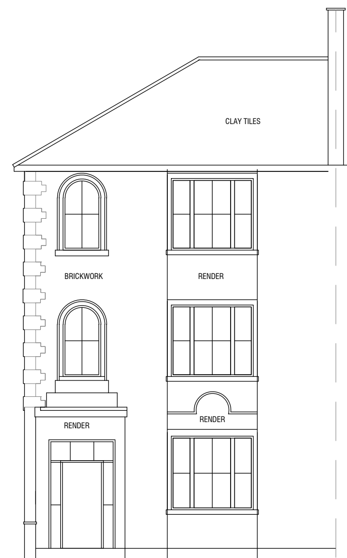
0m 2 4m EXISTING SIDE ELEVATION 1:100