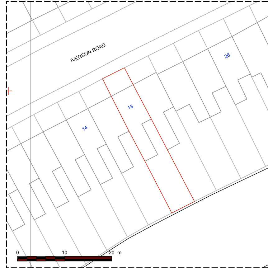
BLOCK PLAN @ SCALE 1:500