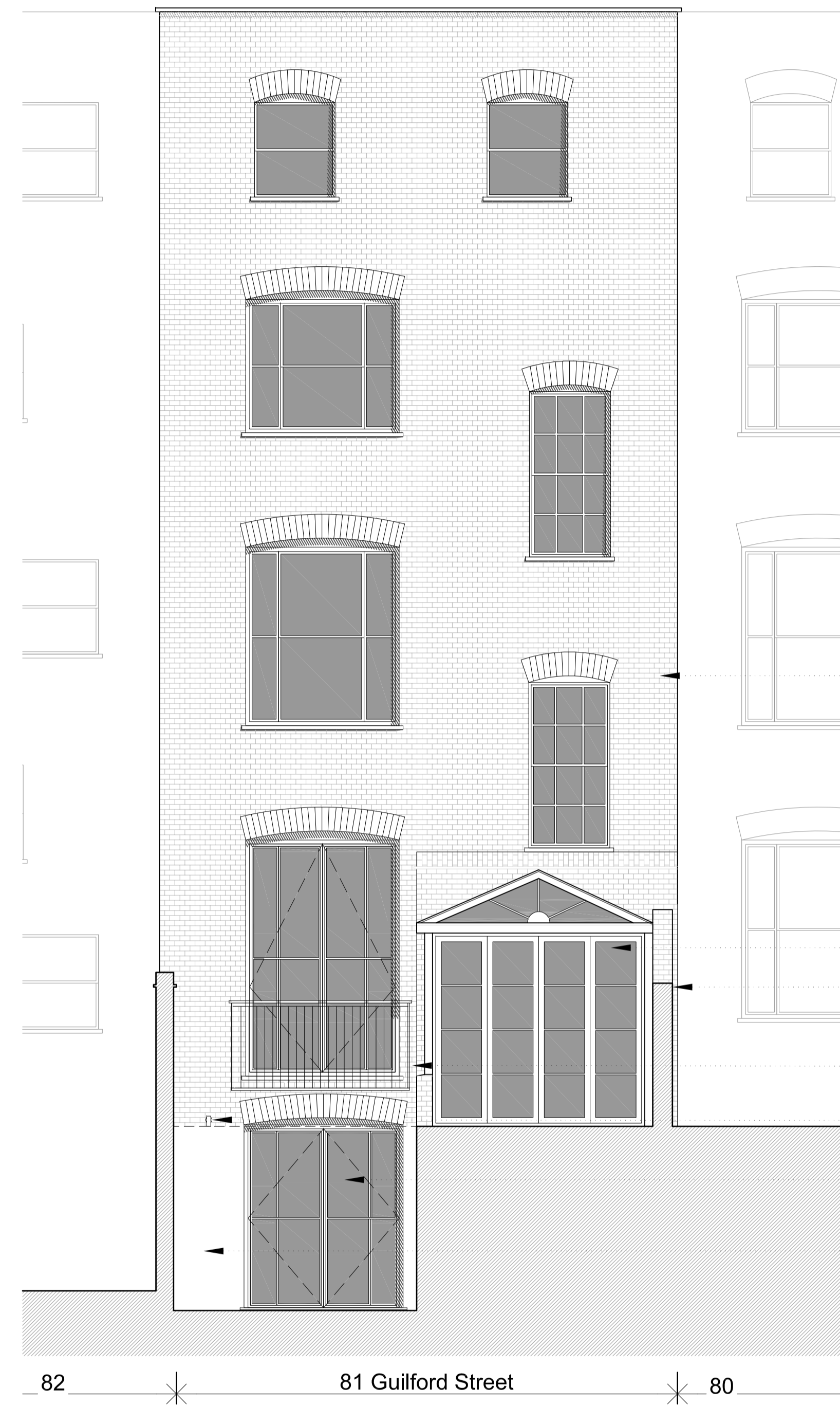
02 Rear Elevation

Existing first floor toilet block extension removed