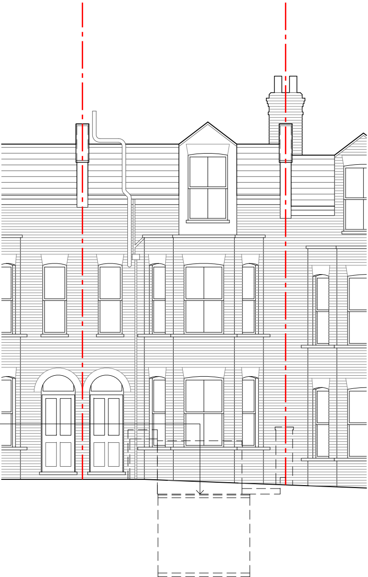
1 Front (West) Elevation - Proposed A-301 Scale 1:100 5m

Front garden lightwell with metal grille per Planning Permission Ref: 2014/7077/P, decision dated 27 Oct 2015