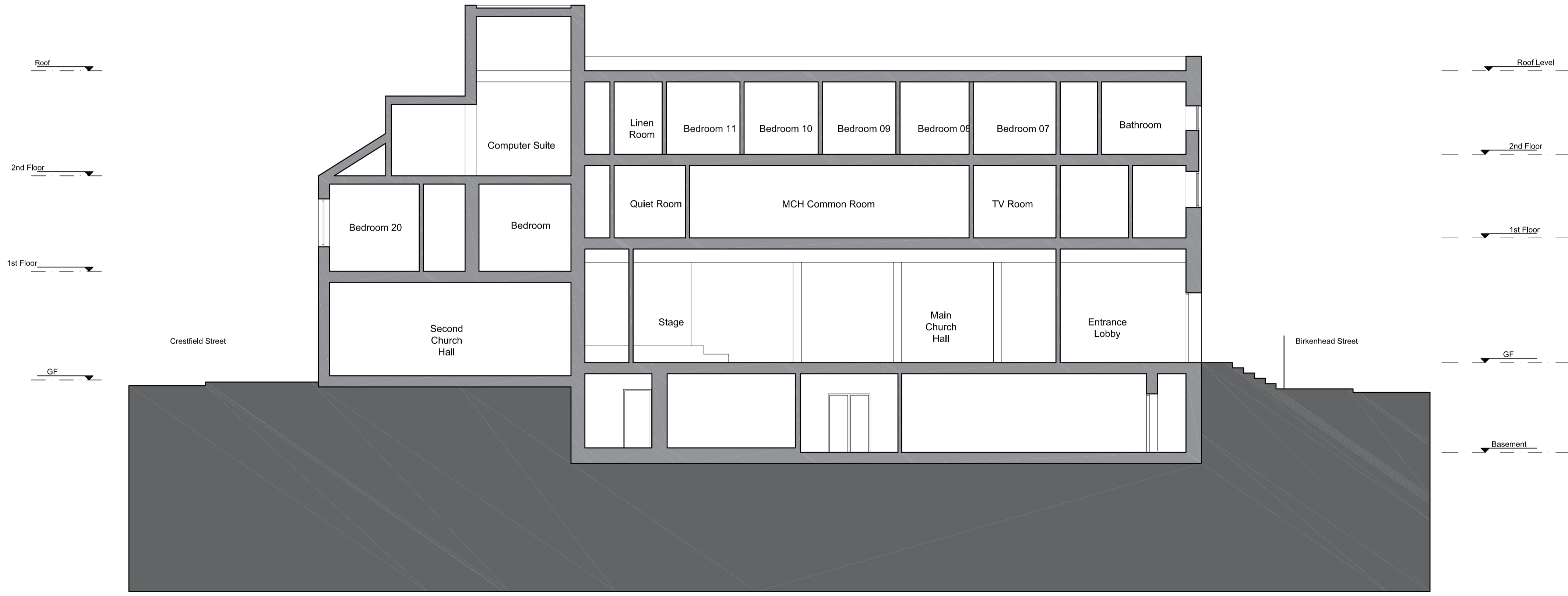
Existing Section AA Scale 1:200 @A3 1:100 @A1