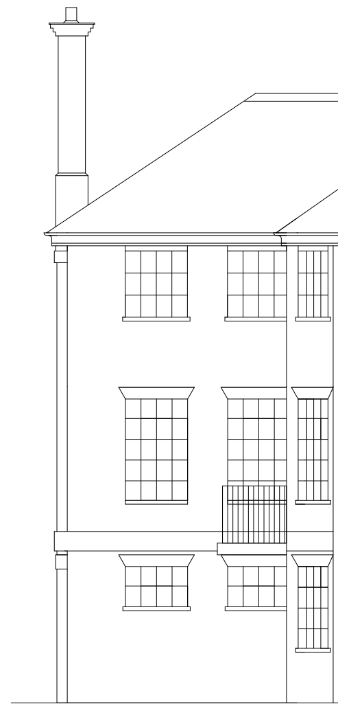
EXISTING REAR/SIDE ELEVATION