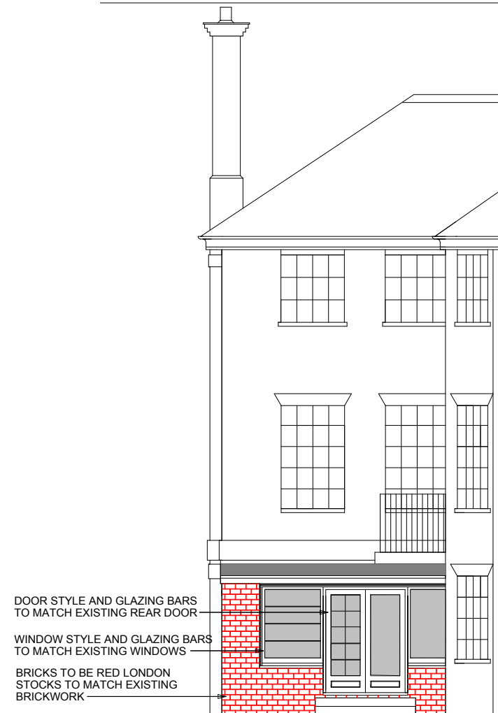
PROPOSED REAR/SIDE ELEVATION

DOOR STYLE AND GLAZING BARS TO MATCH EXISTING REAR DOOR WINDOW STYLE AND GLAZING BARS TO MATCH EXISTING WINDOWS BRICKS TO BE RED LONDON STOCKS TO MATCH EXISTING BRICKWORK