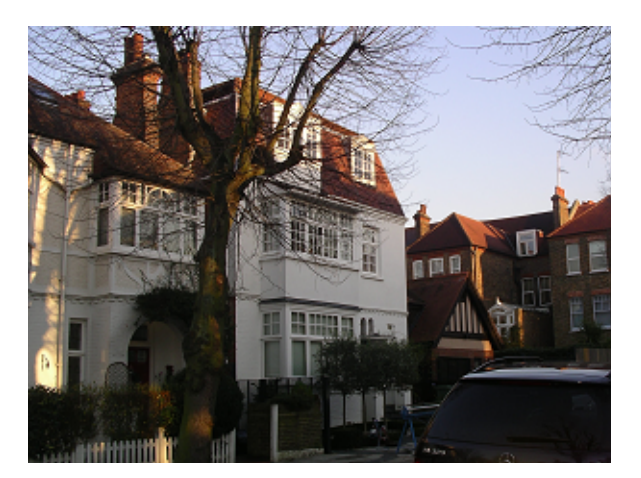
View Southeast from Clorane Gardens