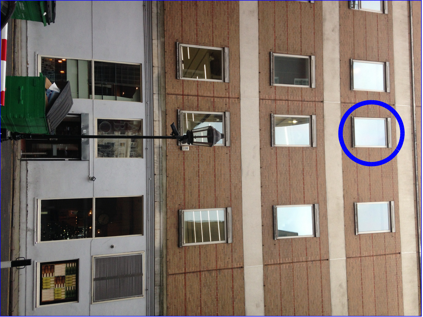
Existing external elevation