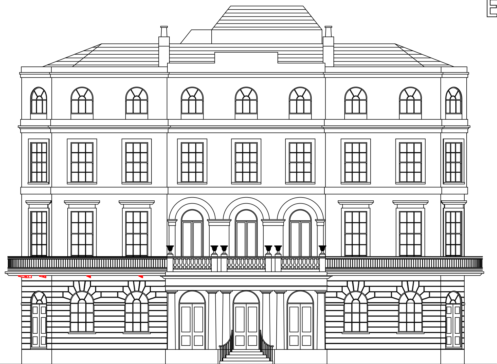
ELEVATION TO MARYLEBONE ROAD

SEE ENGINEERS DETAILS FOR SCHEDULE OF WORKS PREPARED (SEE PHOTOS 1,2,3,4 & 5).