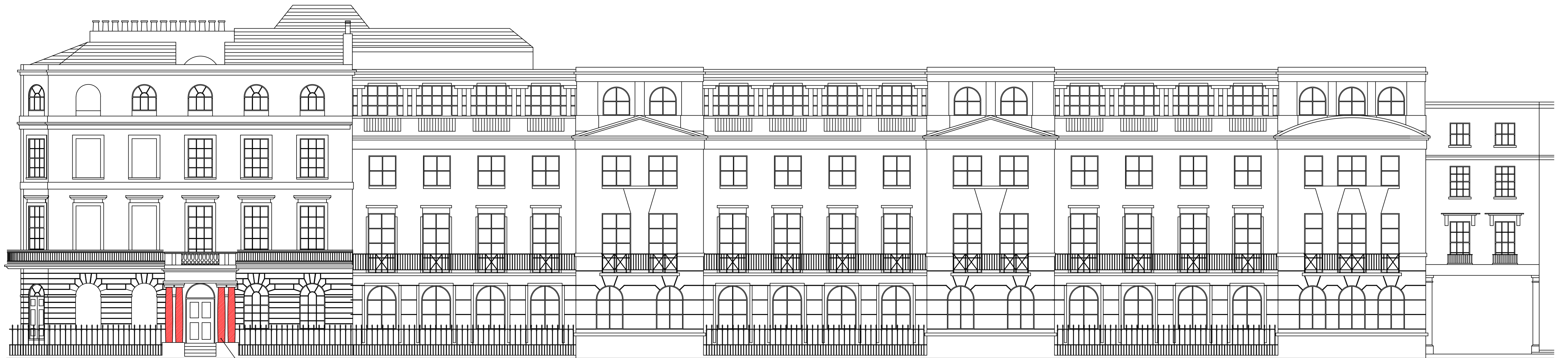
ELEVATION TO ALBANY STREET