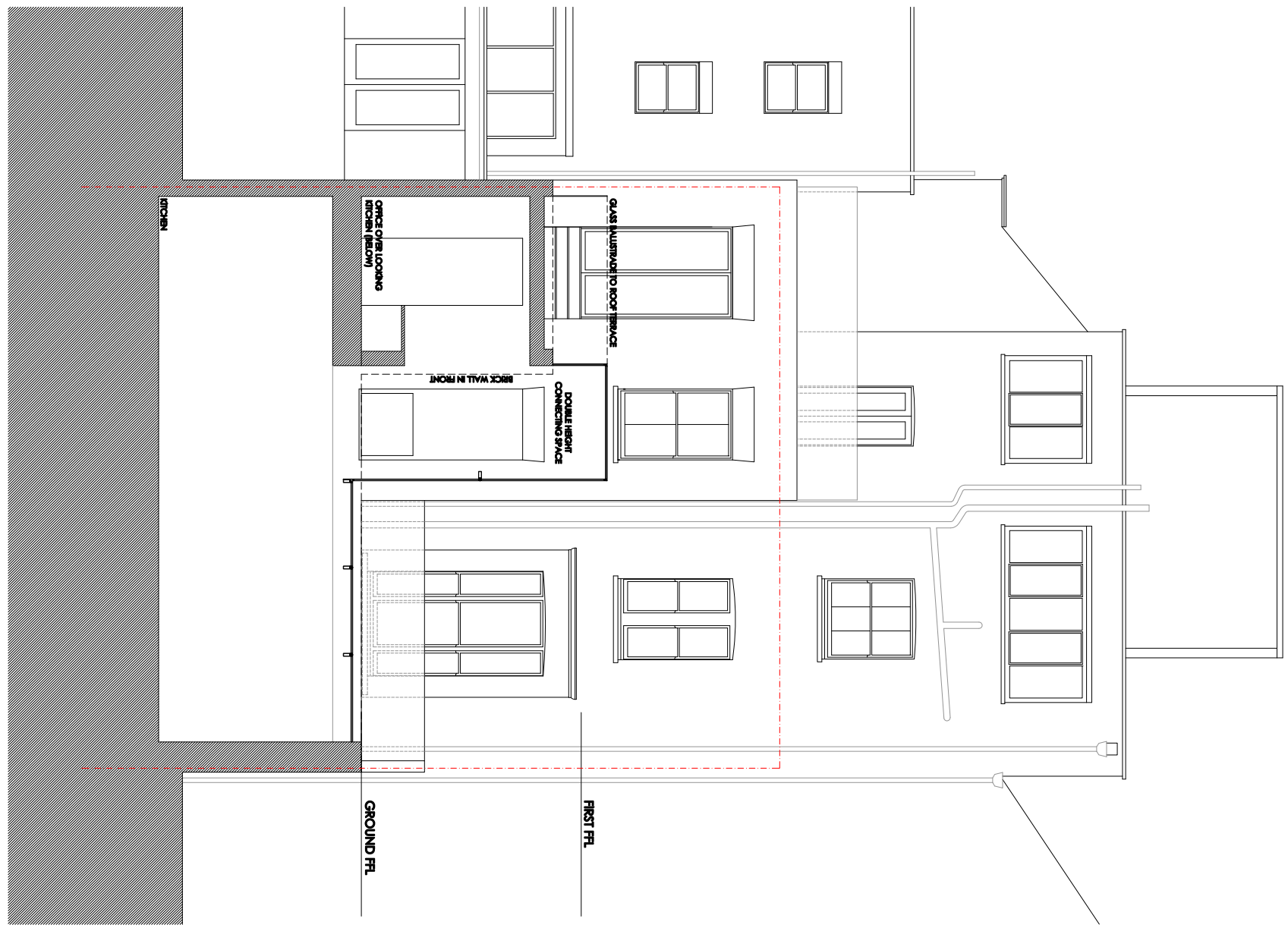
PROPOSED SECTION C - THROUGH NEW REAR EXTENSION 1:100@A3