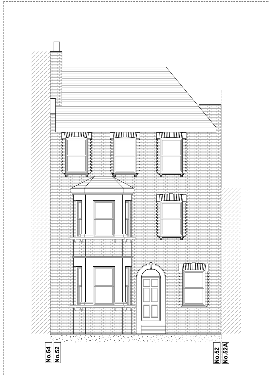
FRONT ELEVATION EXISTING 1:100