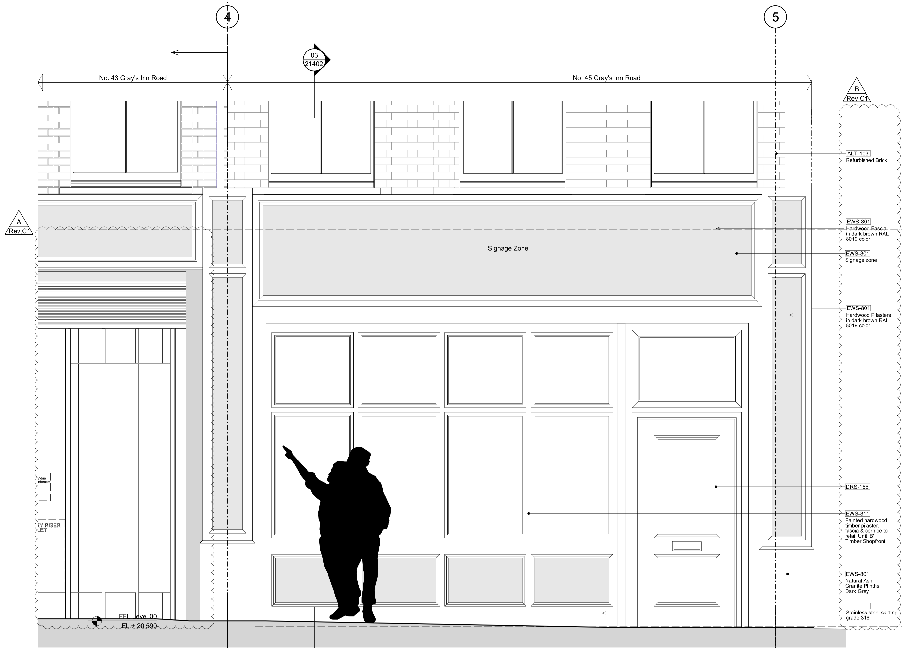
01 Elevation: Retail Unit B Shopfront 1:20