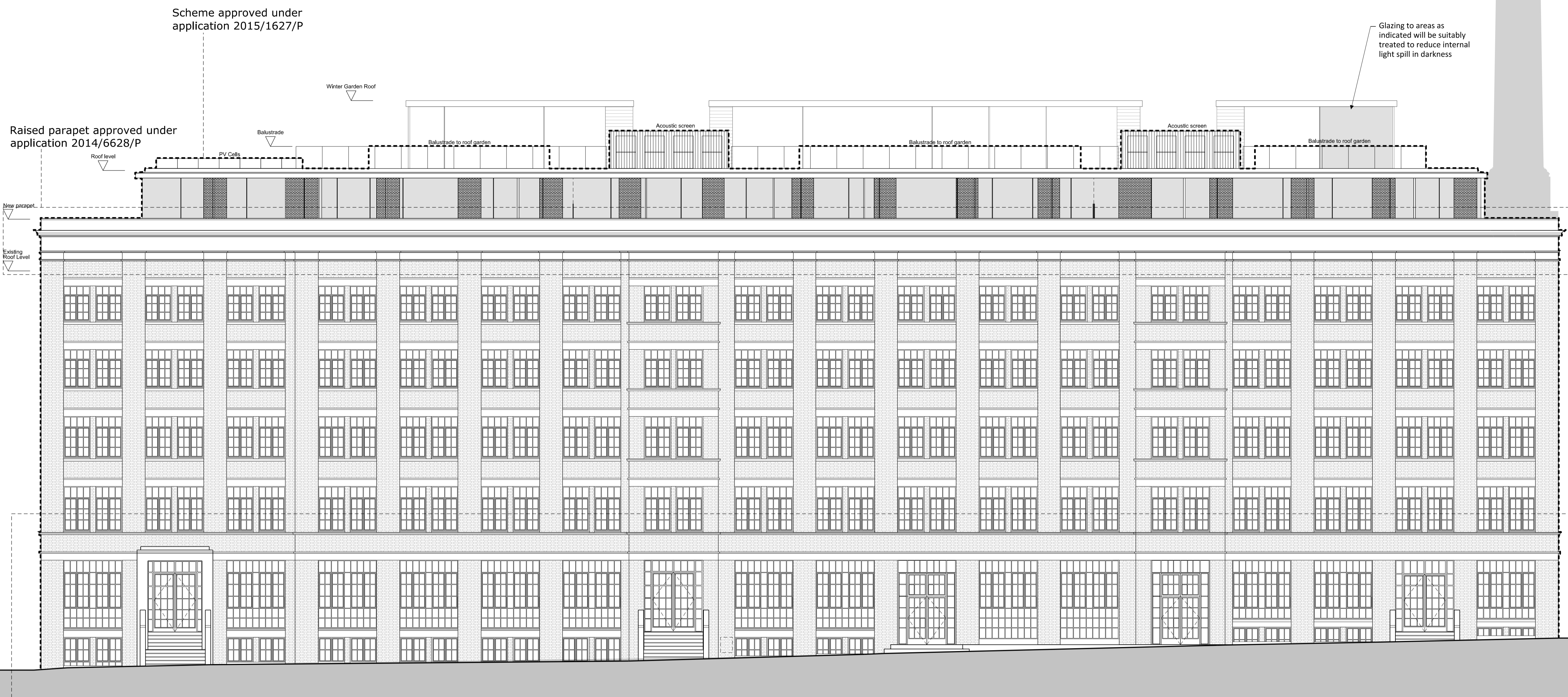
Ground floor elevation approved under application 2014/6628/P

1 East elevation as proposed 152_301 Scale 1:100 @ A1