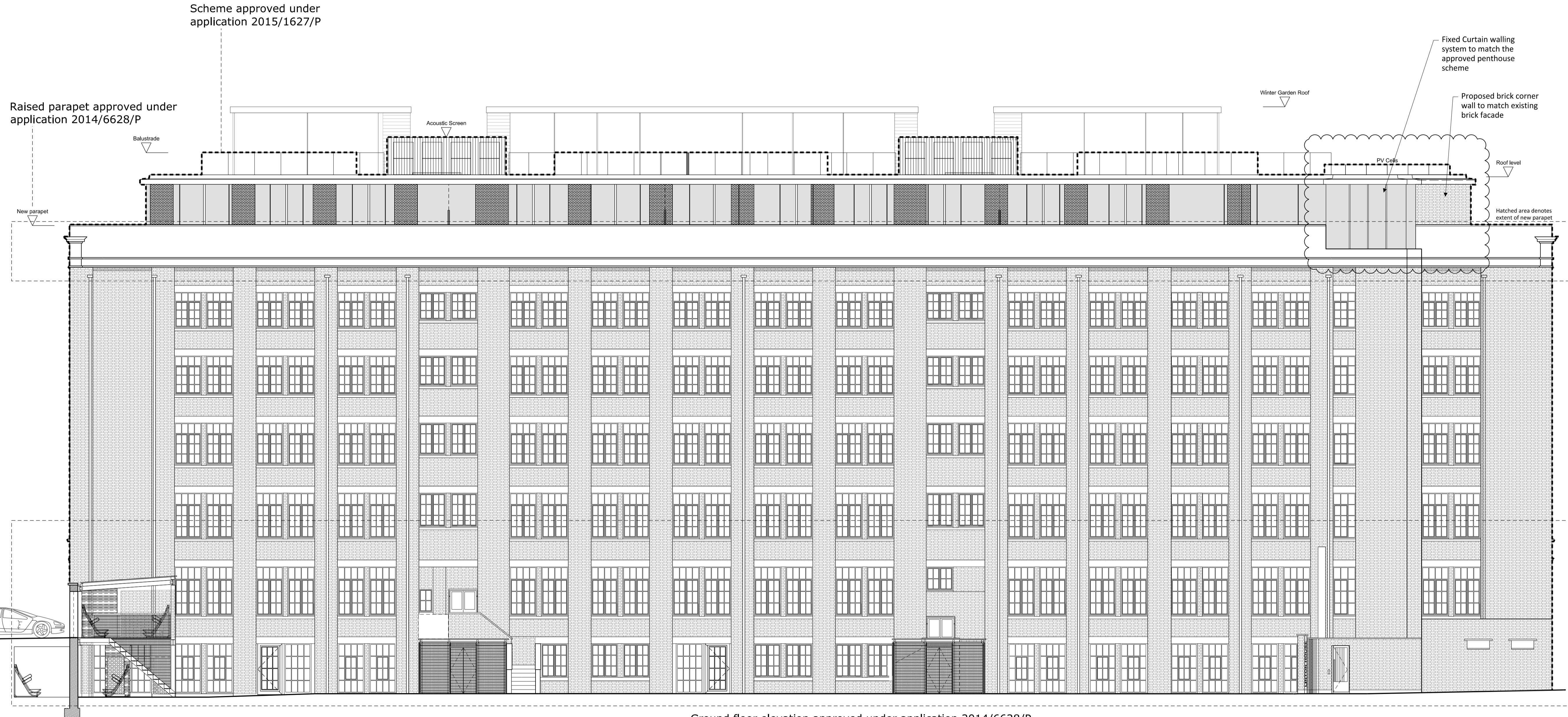
Ground floor elevation approved under application 2014/6628/P

1 West elevation as proposed 152_302 Scale 1:100 @ A1