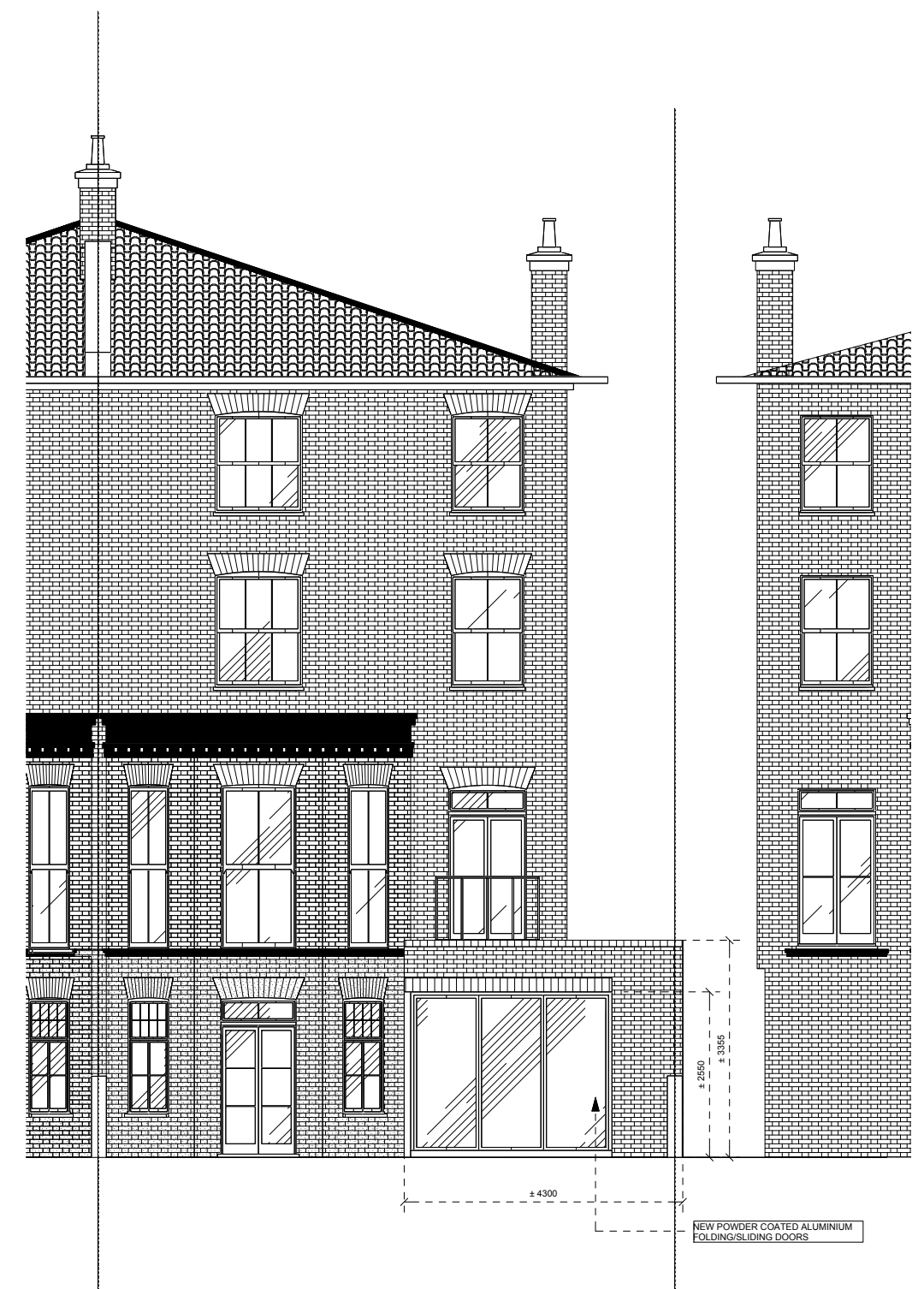
103 REAR ELEVATION AS APPROVED

AS PREVIOUSLY APPROVED DRAWING PLANNING REFERENCE: 2014/4359/P DRAWING NO. 056_01C