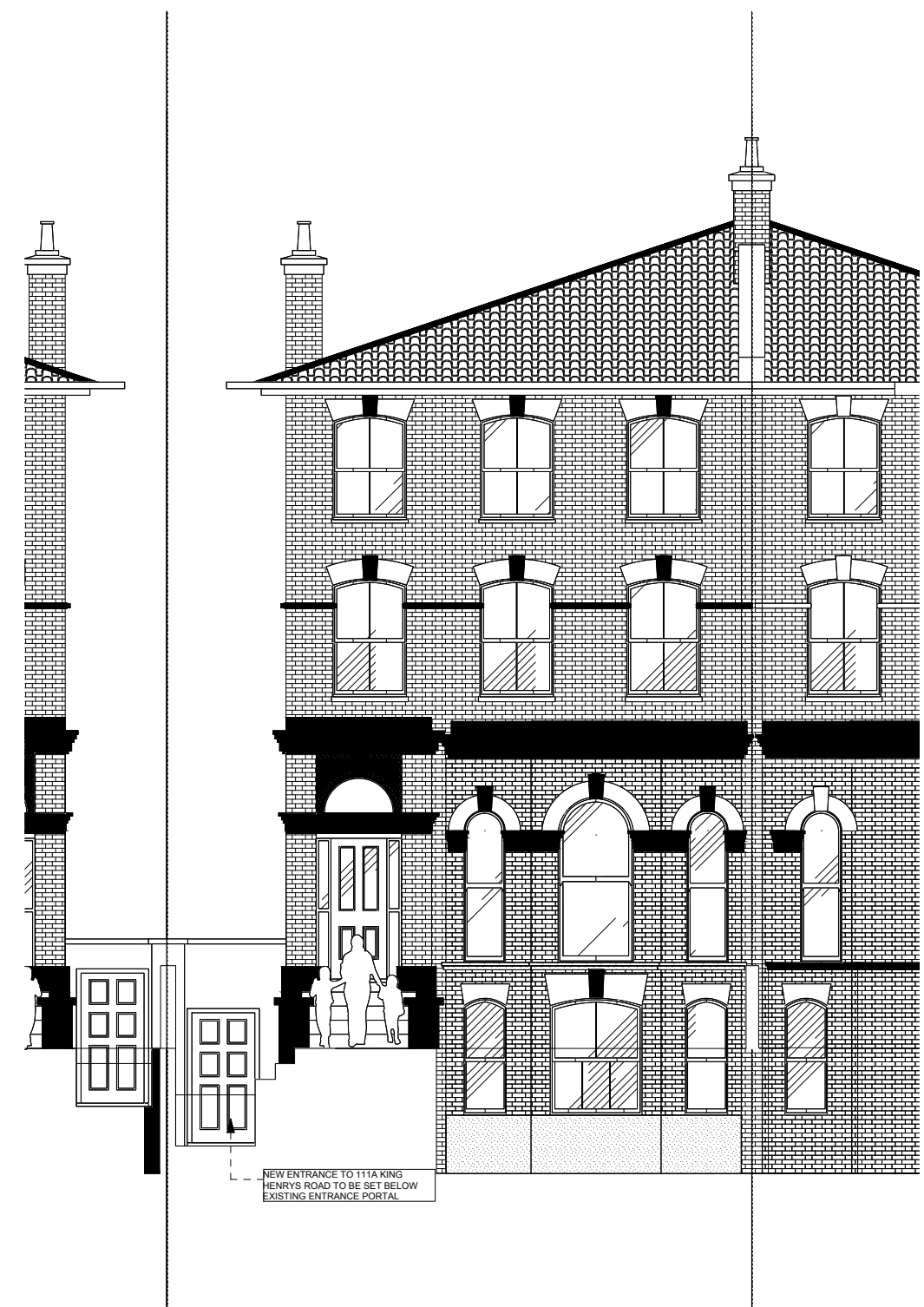
103 FRONT ELEVATION AS APPROVED

General Notes: All dimensions and heights to be checked on site prior construction. Any discrepancies between site, drawing or specification to be reported to the architect immediately. Do not scale drawings. The setting out is the contractor's responsibility