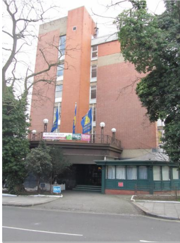
A section of Upper Ground floor extends over part of the car park.