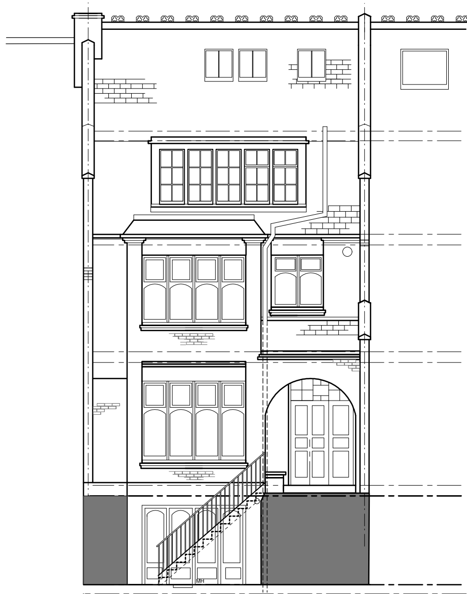
APPROVED FRONT ELEVATION