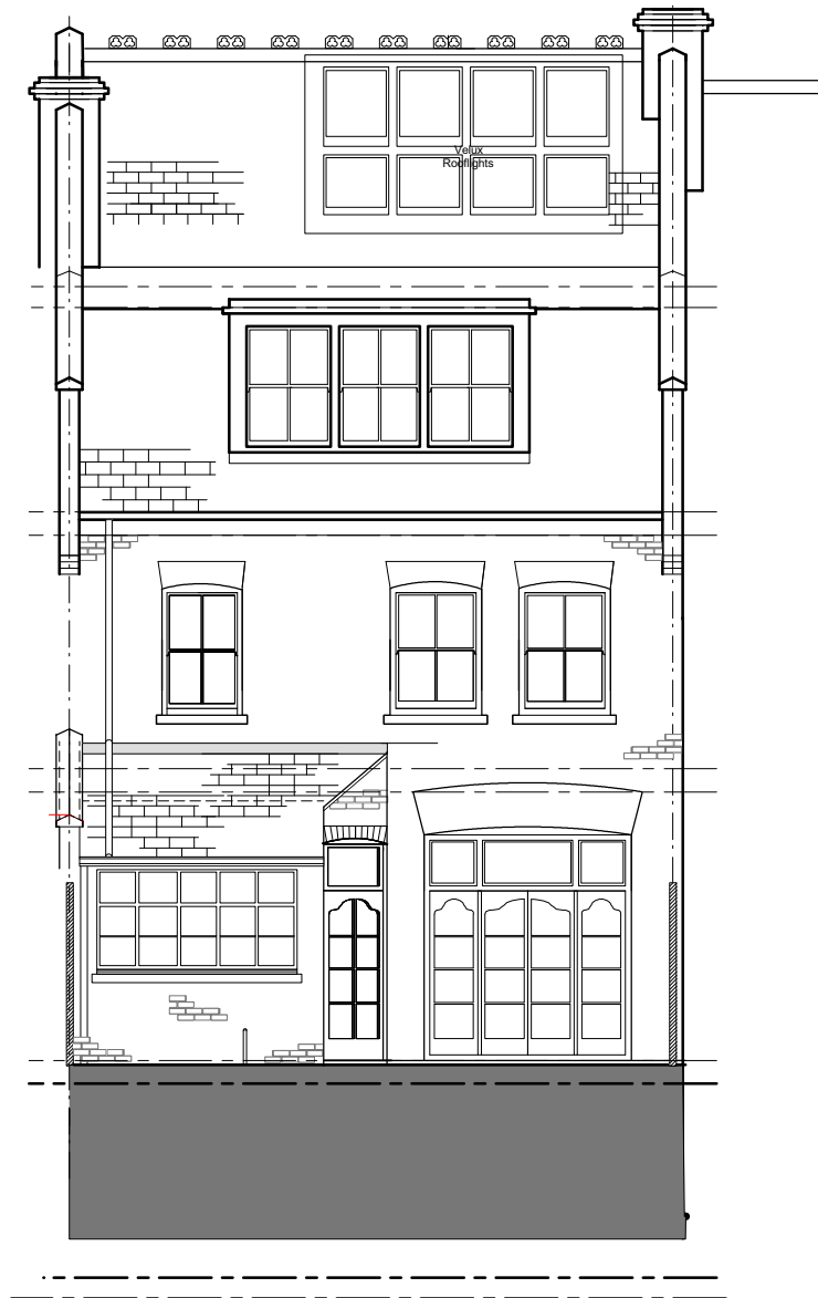
PROPOSED BACK ELEVATION