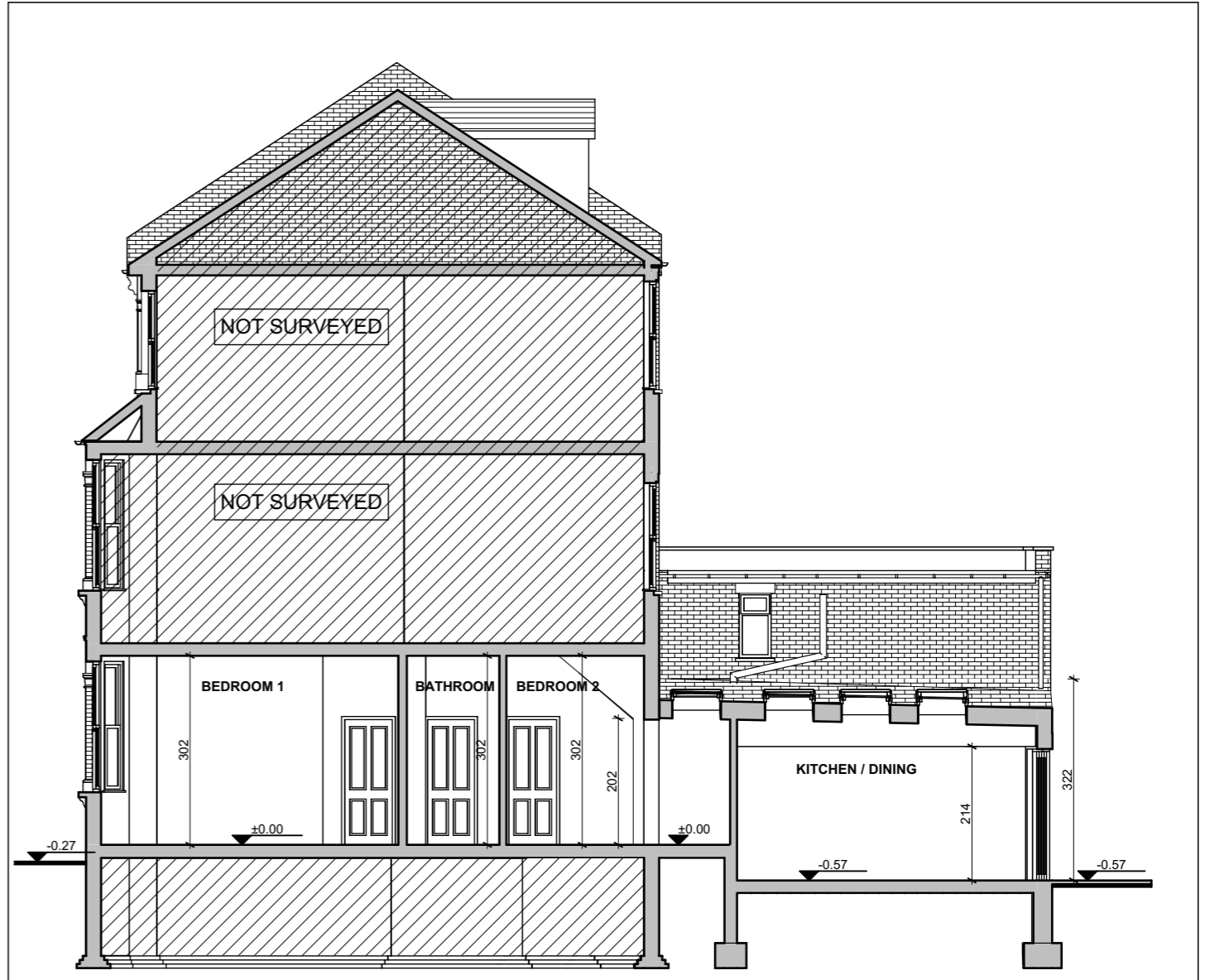
SECTION CC - PROPOSED