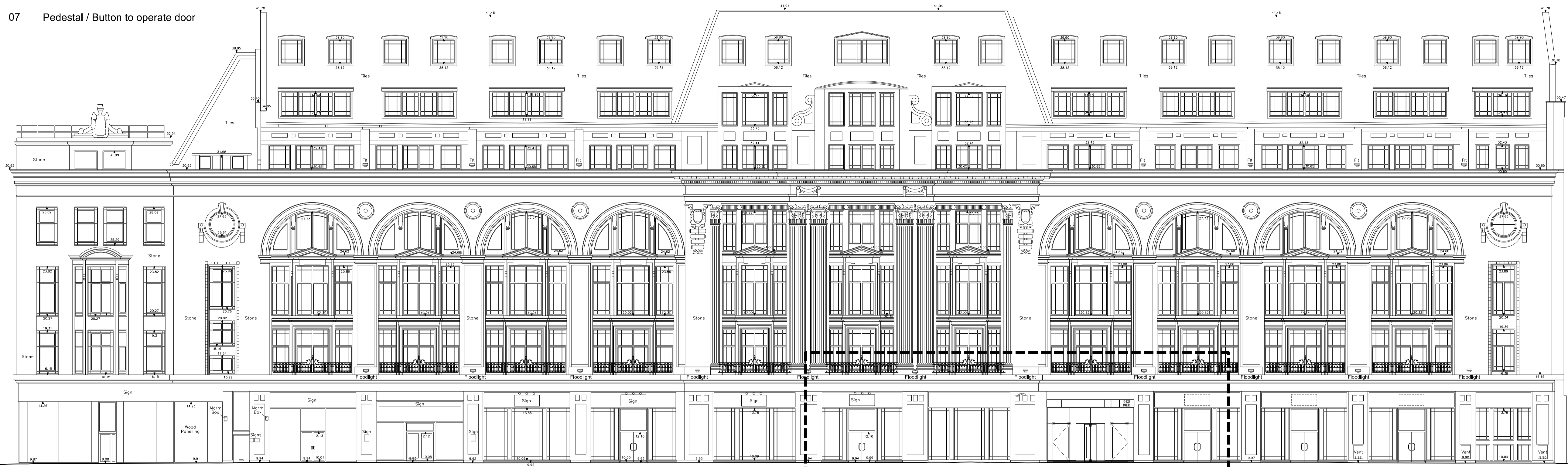
1 Front Elevation, NTS