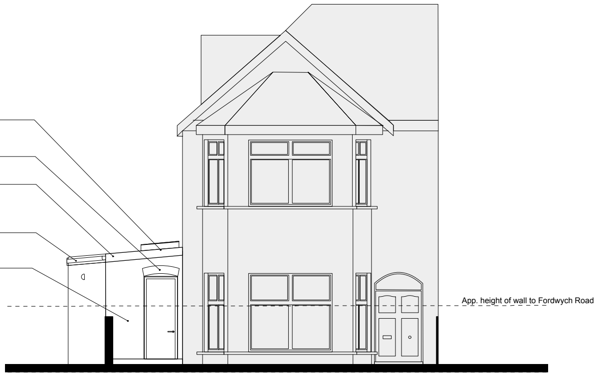
North-East (front) Elevation

Opening rooflight (1000x1000mm kerb span). Flushglaze GlazingVision or similar. Arched brick soldier course above doors Modified bitumen, single ply roofing system. Roof laid to fall towards gutter, 5 degree pitch. Gutter to fall to rainwater downpipe Brick wall. To match existing brick of house