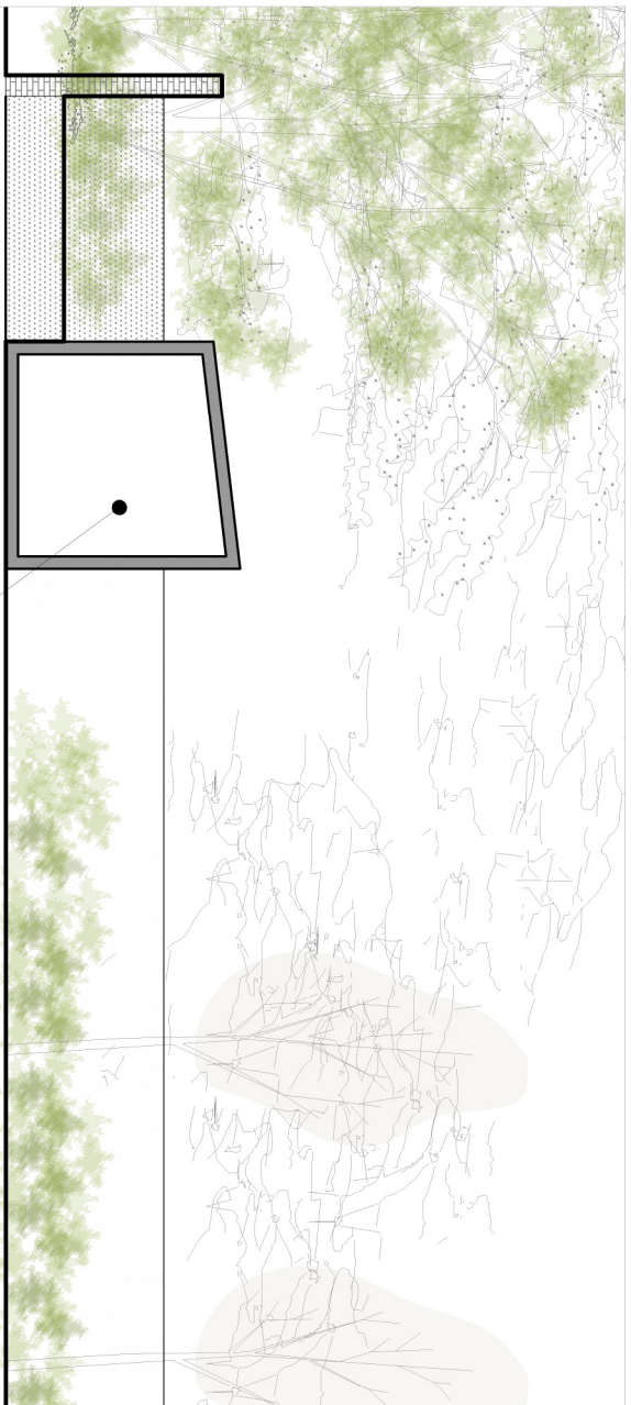
EAST ELEVATION SCALE 1:100