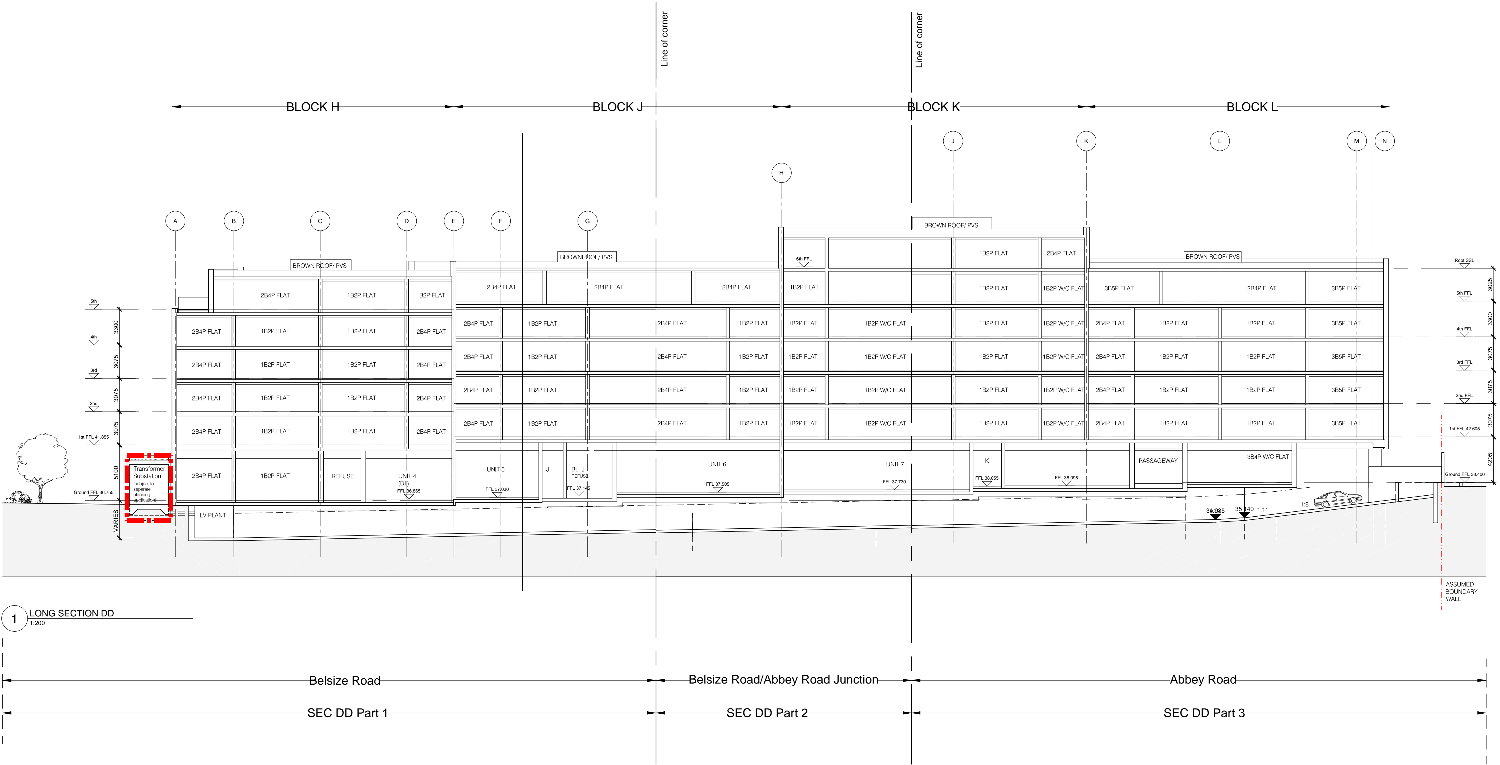
1 LONG SECTION DD 1:200

GENERAL NOTES This drawing is © 2014 PTE architects Use figured dimensions only. DO NOT SCALE. All dimensions are in millimetres unless noted otherwise All levels are in metres above ordnance datum unless noted otherwise This drawing must be read in conjunction with all other relevant drawings and specifications from the Architect and other consultants If in doubt, ask