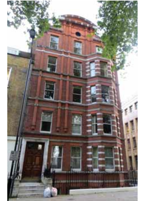
3 EXISTING PRINCIPLE FACADE