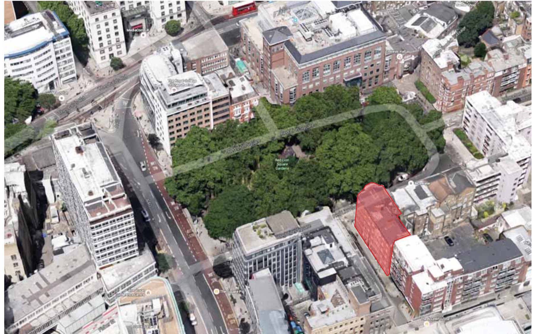
1 VIEW OF THE SITE'S RELATIONSHIP WITH SQUARE SHOWING PROMINENT LOCATION

1.2.2 It is an attractive late Victorian building but is without any particular architectural merit or distinction. Nevertheless it makes a positive contribution to the character and appearance of the Bloomsbury Conservation Area.