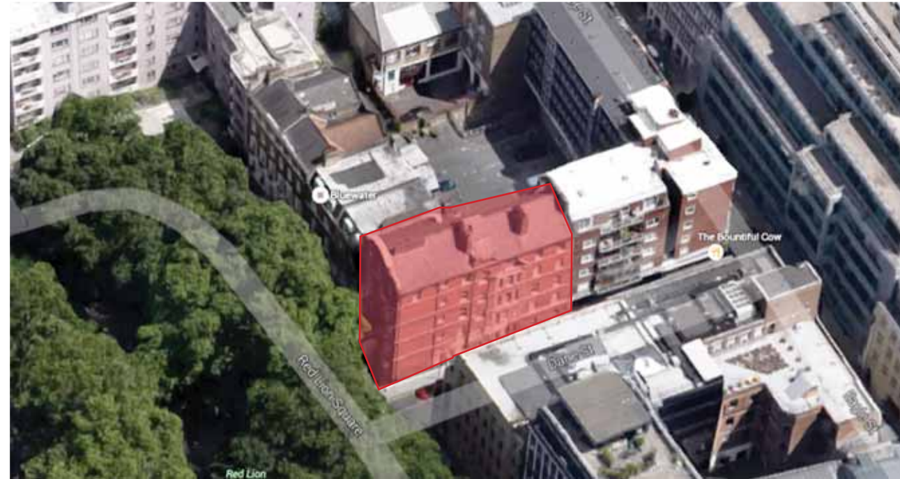
2 MASSING SHOW KEY CORNER AND ELEVATIONS