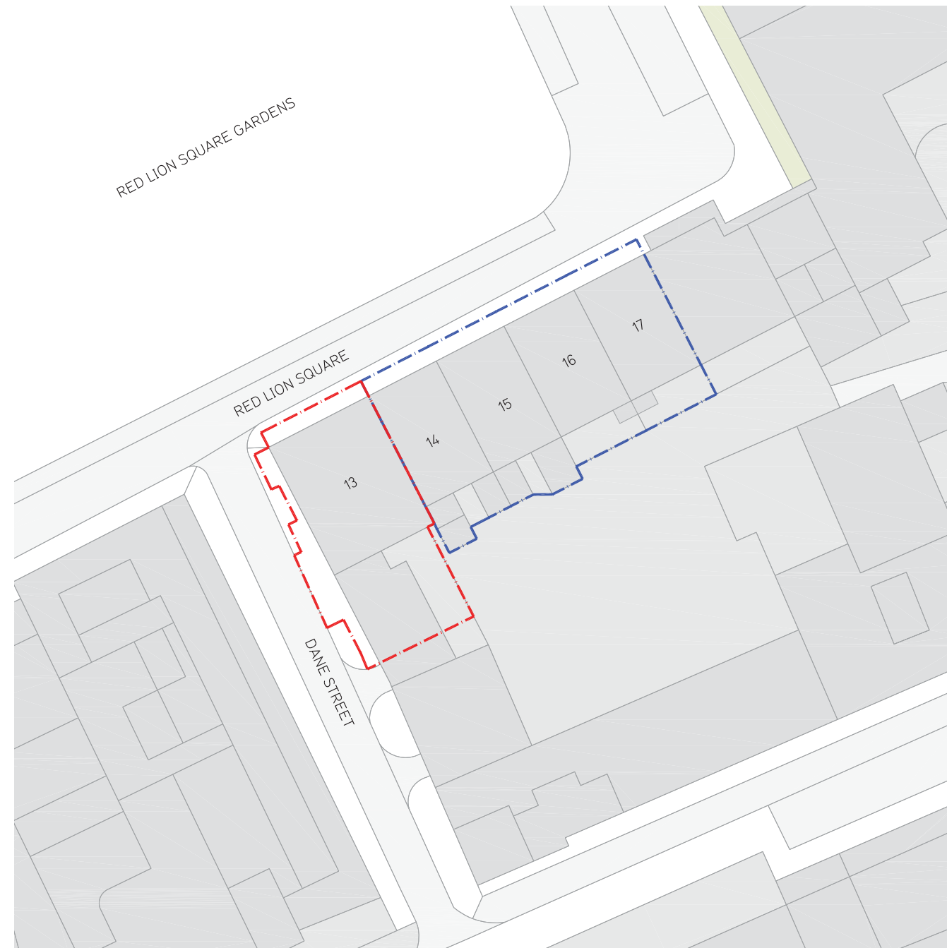
1 MAP OF IMMEDIATE CONTEXT

1.1.3 The property stands on the corner of Dane Street and Red Lion Square with two respective entrances on each side leading to the central stair core. The proposal is in the heart of Holborn with the underground station approximately 5-10 minutes walk away.