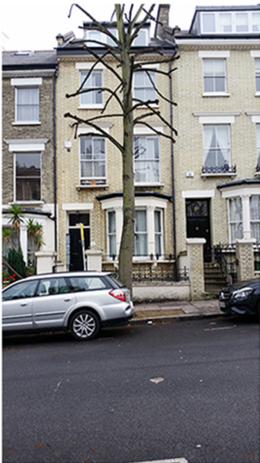
Existing Street Elevation - to remain unchanged