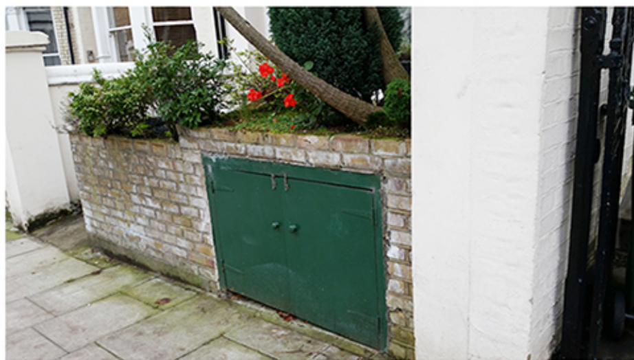
Bin Storage at front street wall of neighbour at 11 Ainger Road