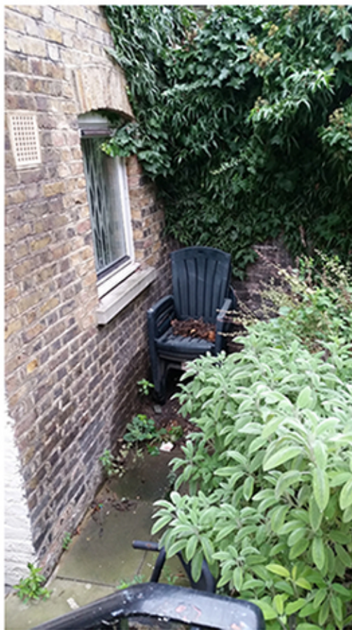
Existing paved courtyard - position of proposed new bay window