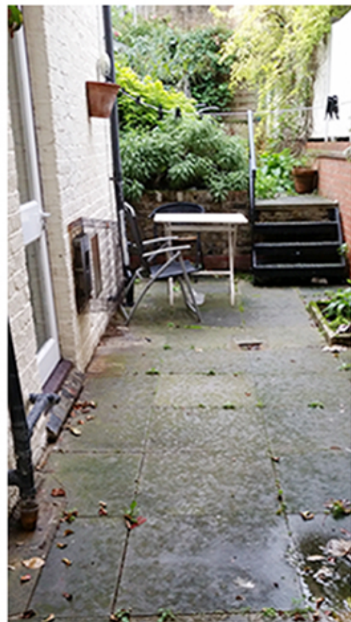
Existing paved courtyard - position of proposed new side infill extension