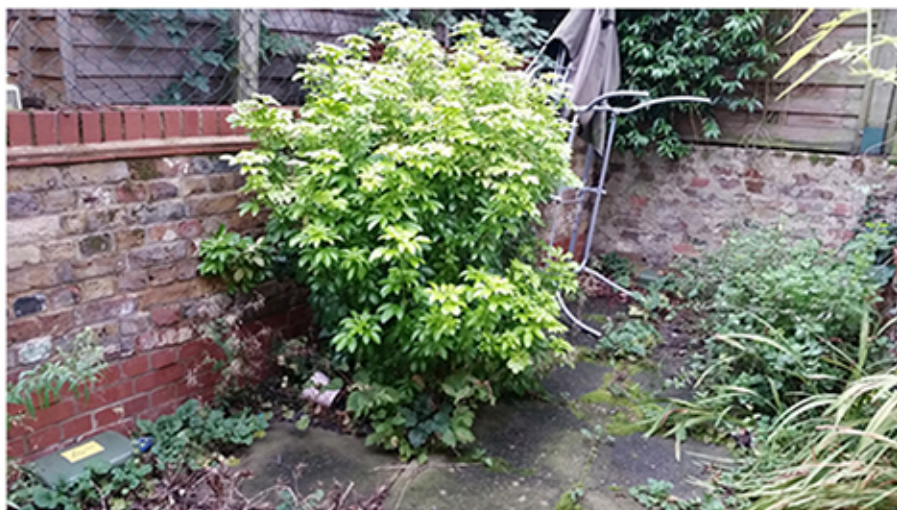
Existing partly paved Garden

PROJECT 12 AINGER ROAD NW3 3AR - PROPOSED INTERNAL REFURBISHMENT + LOWER GROUND FLOOR SIDE INFILL