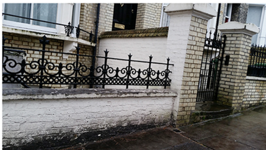
Existing front street wall and proposed position of bin storage

PROJECT 12 AINGER ROAD NW3 3AR - PROPOSED INTERNAL REFURBISHMENT + LOWER GROUND FLOOR SIDE INFILL