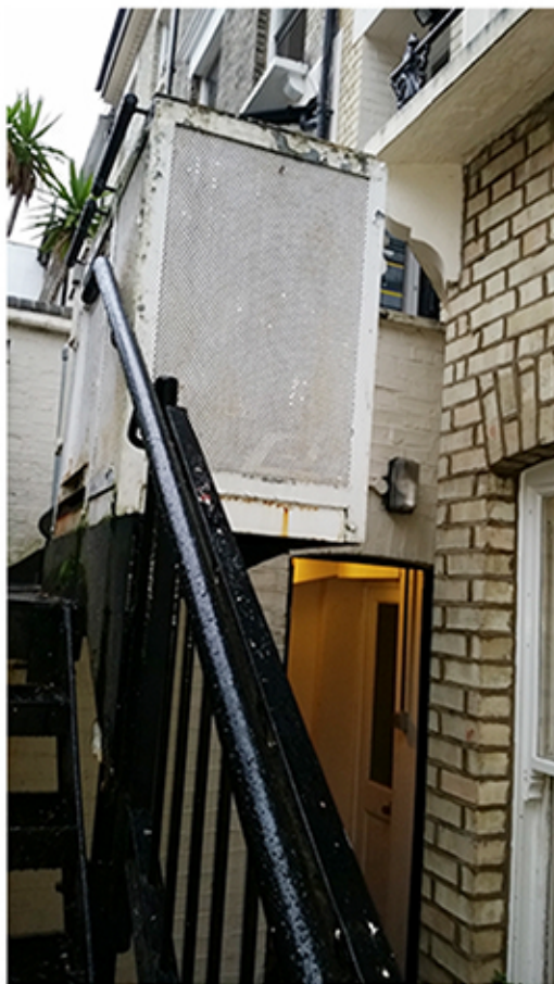
Existing suspended Bin Storage - to be moved to front street wall