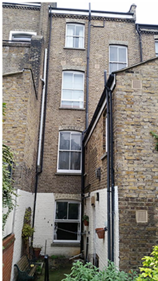
Existing paved courtyard - position of proposed new side infill extension