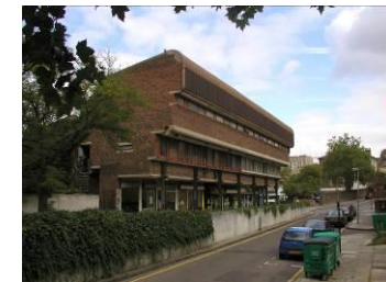
Nos. 1-8 Langtry Walk