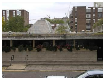
Jack Taylor School