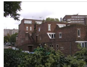
2-62 Alexandra Place