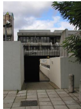
No.9 Langtry Walk