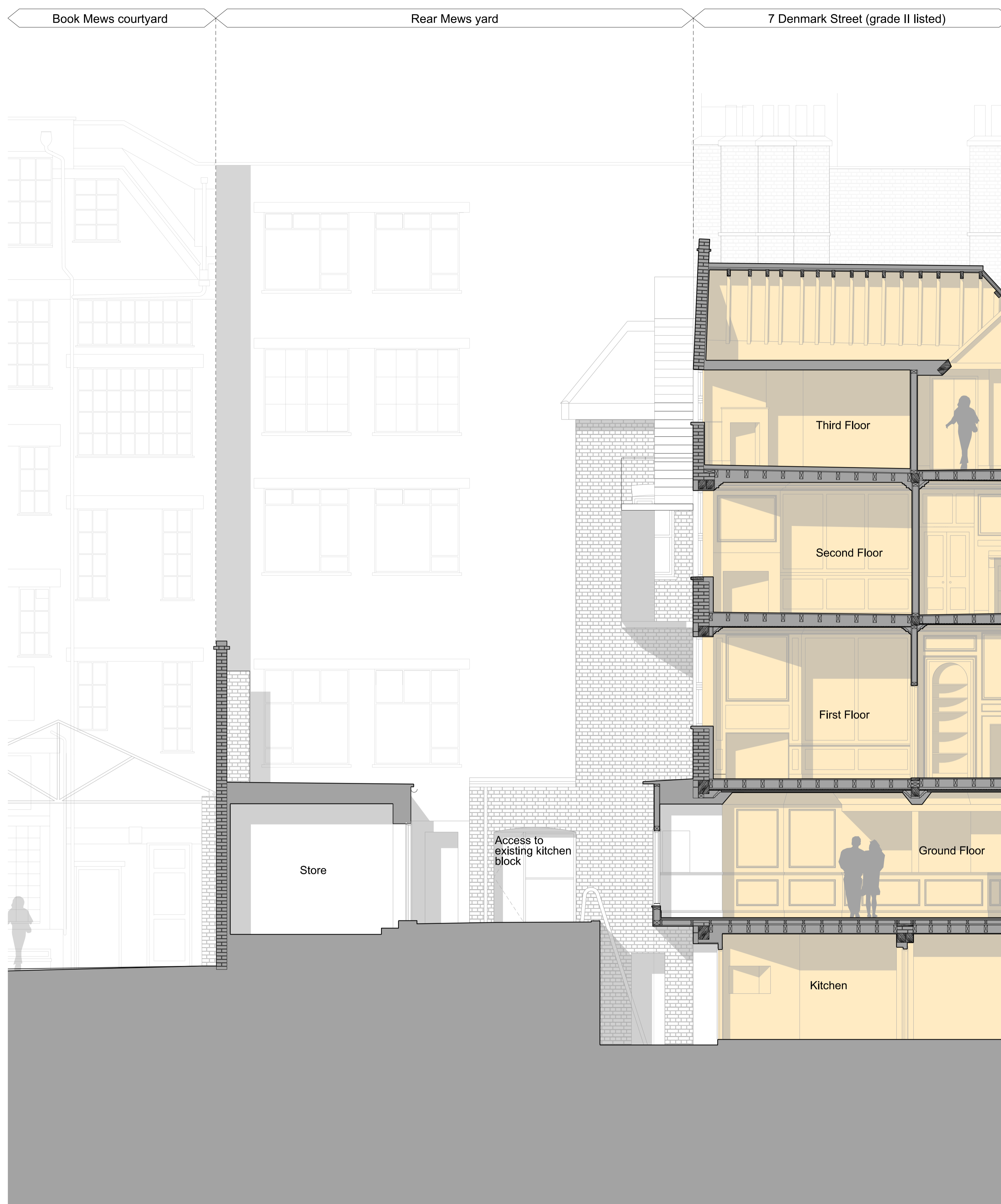
01 Existing Section - Through Main House + Mews Bulding 7D(PL-EX)11 Looking West 1:50