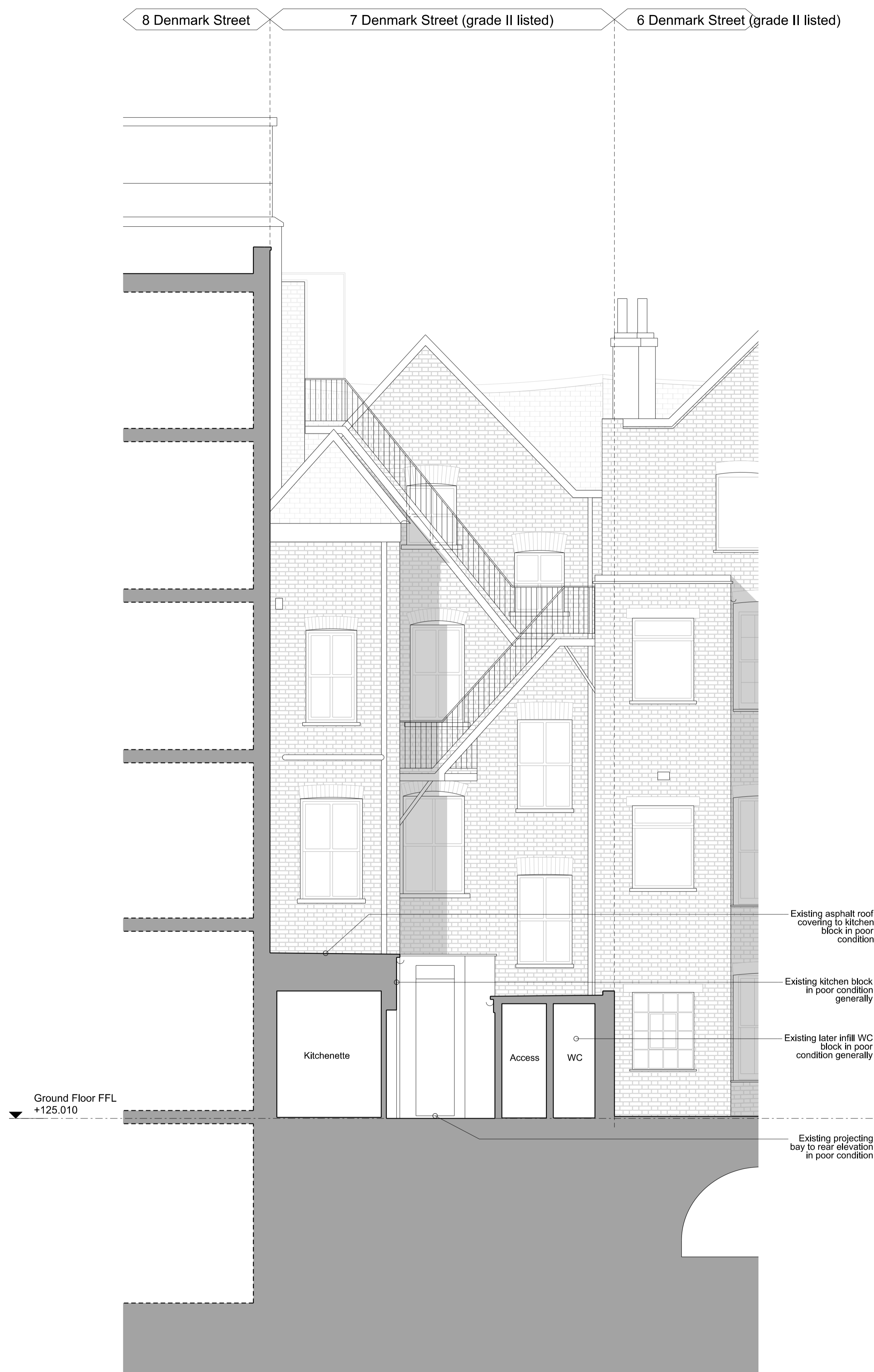
01 Existing Section - Showing rear elevation 7D(PL-EX)13 Main House 1:50