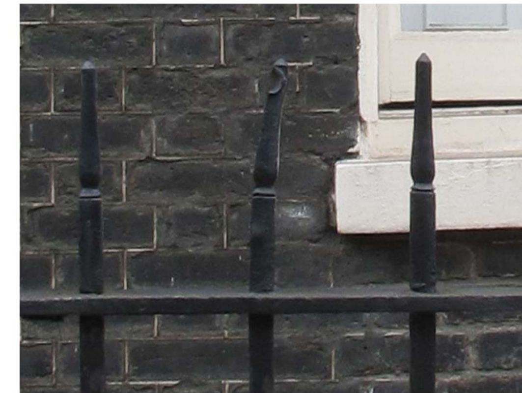
IMAGE OF DAMAGED FINIAL TO BE REPLACED TO MATCH ADJACENT