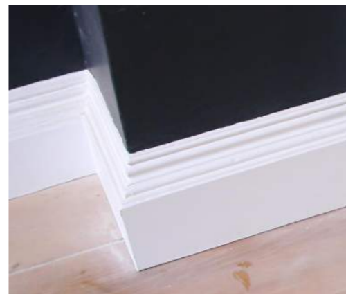
Original skirting from room 1.03