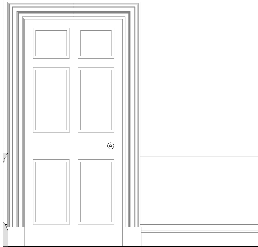
1:20 First Floor Joinery