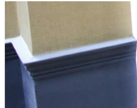
Original dado from room 1.03