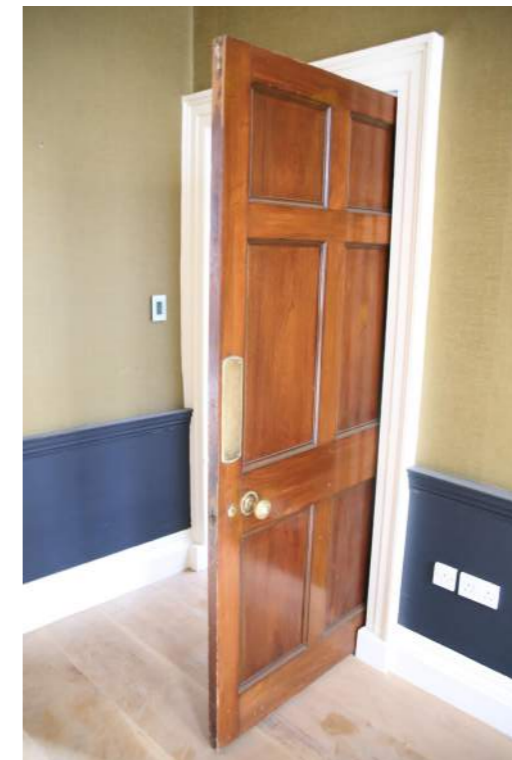
Original door from room 1.03