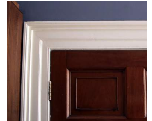
Original architrave from room 0.06