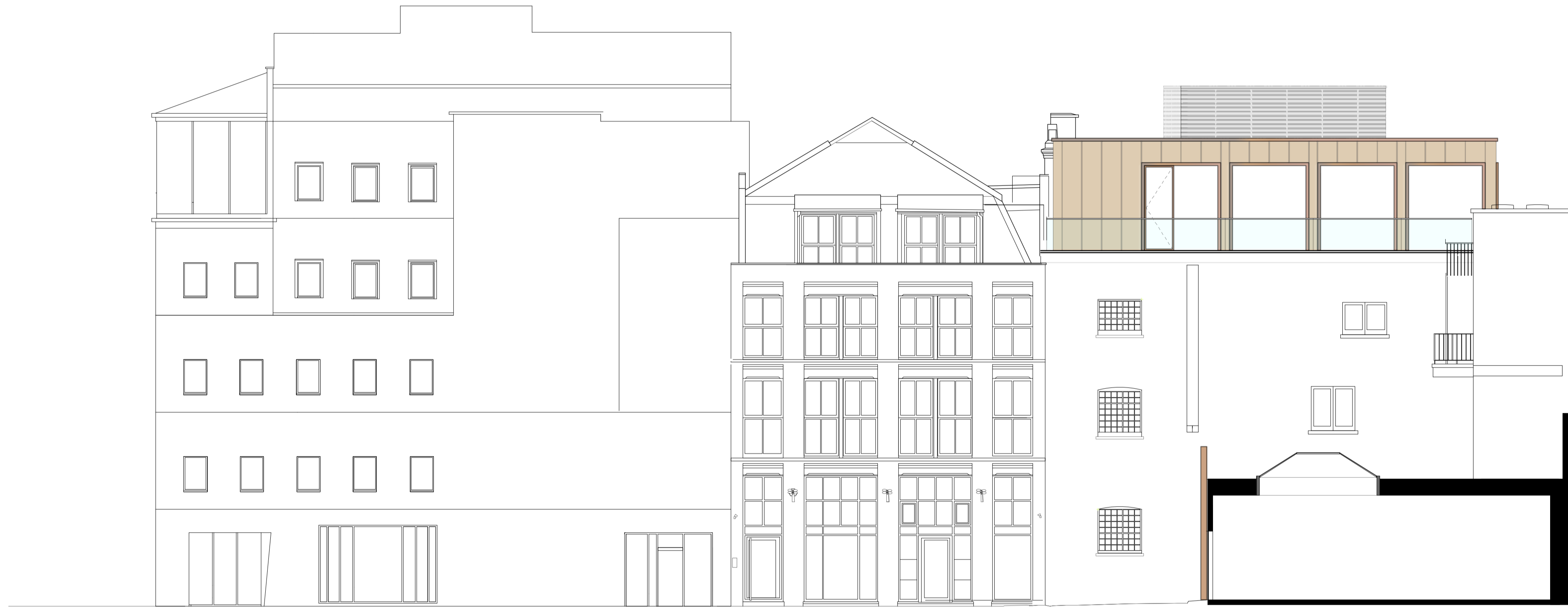
02 North Elevation 1:100 @ A1