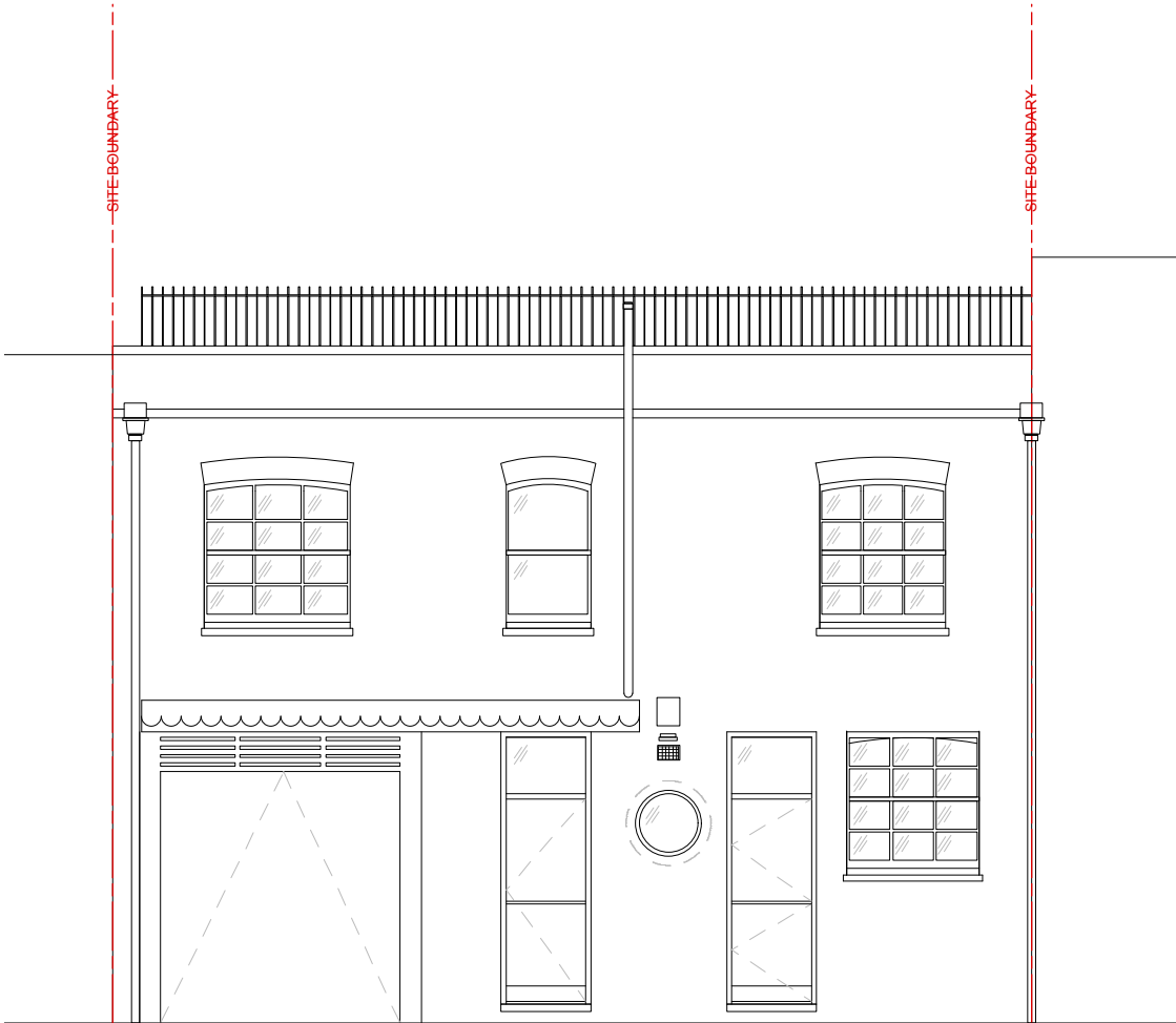
01 Existing Elevation