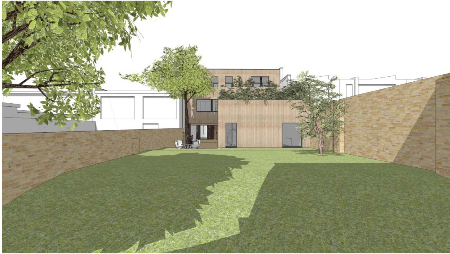
A. View from the rear of 3 Camden Square, showing set back partial third storey with plantings in front.