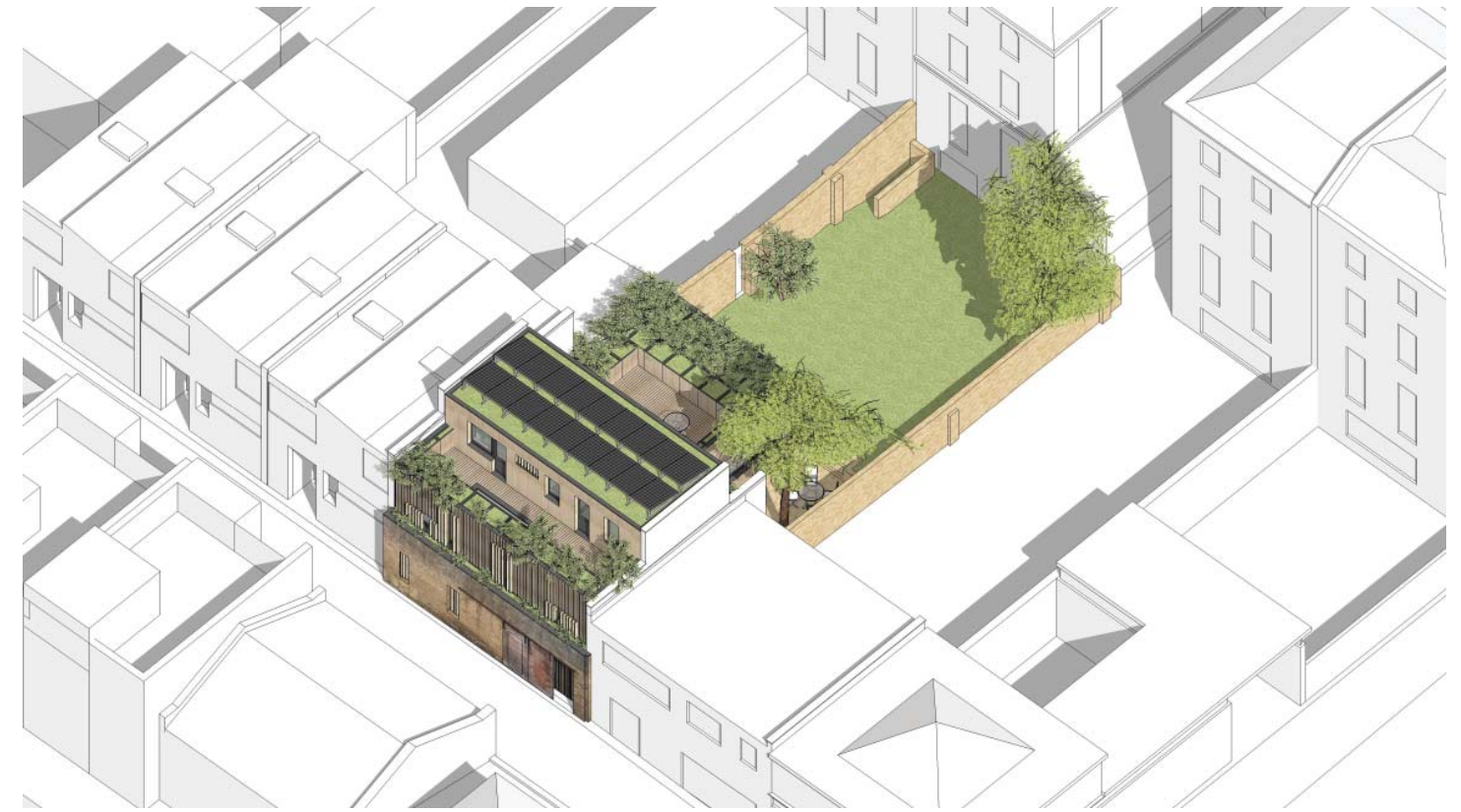
D. Isometric view of the scheme, showing the significant setting back and sinking down of the partial third storey.