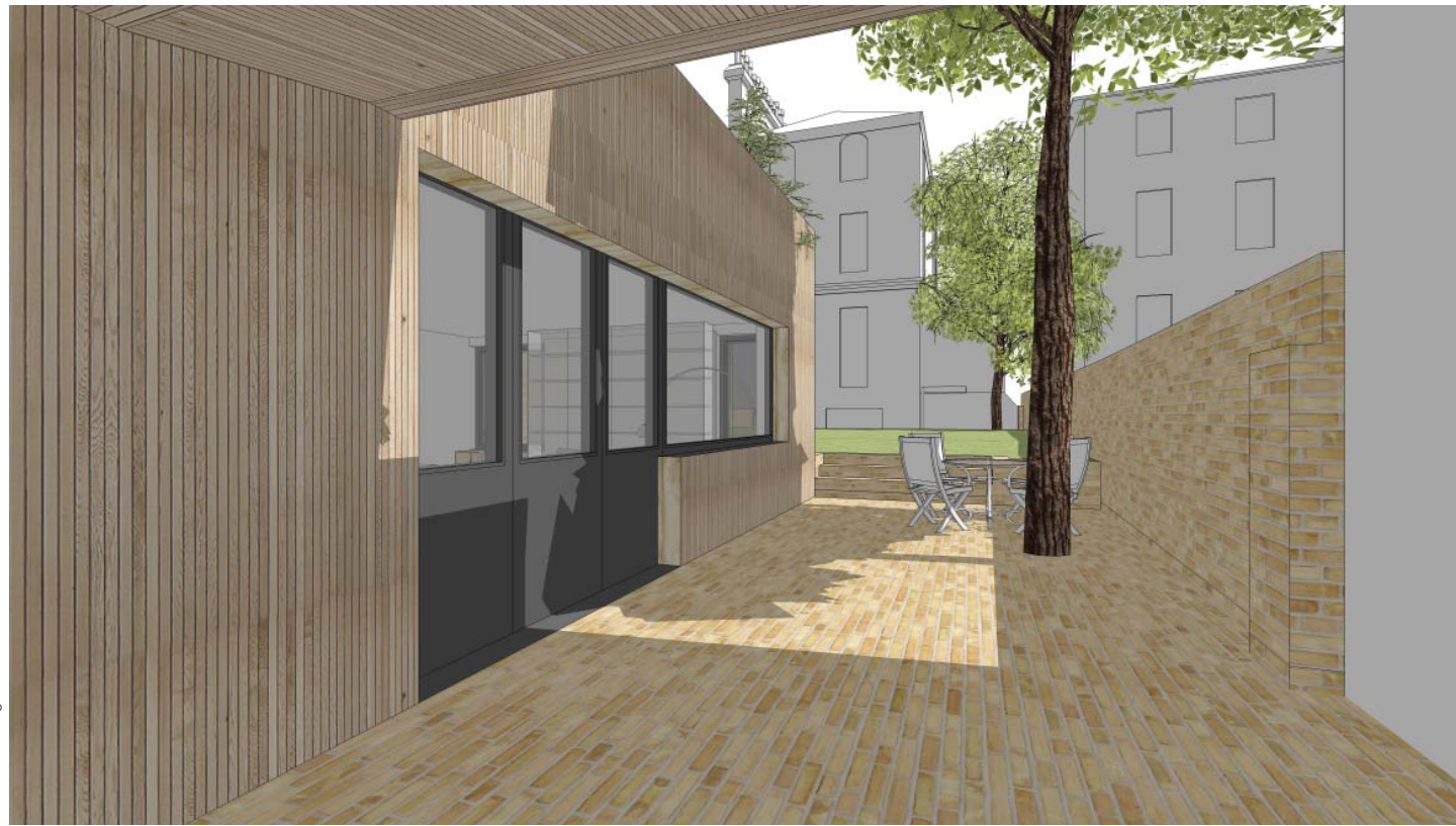
C. View looking through breezeway garden from gate off of Camden Mews towards 3 Camden Square, showing the rear ground floor volume reaching into the garden to gather more sunlight and the preserved view of 3 Camden Square from the mews.