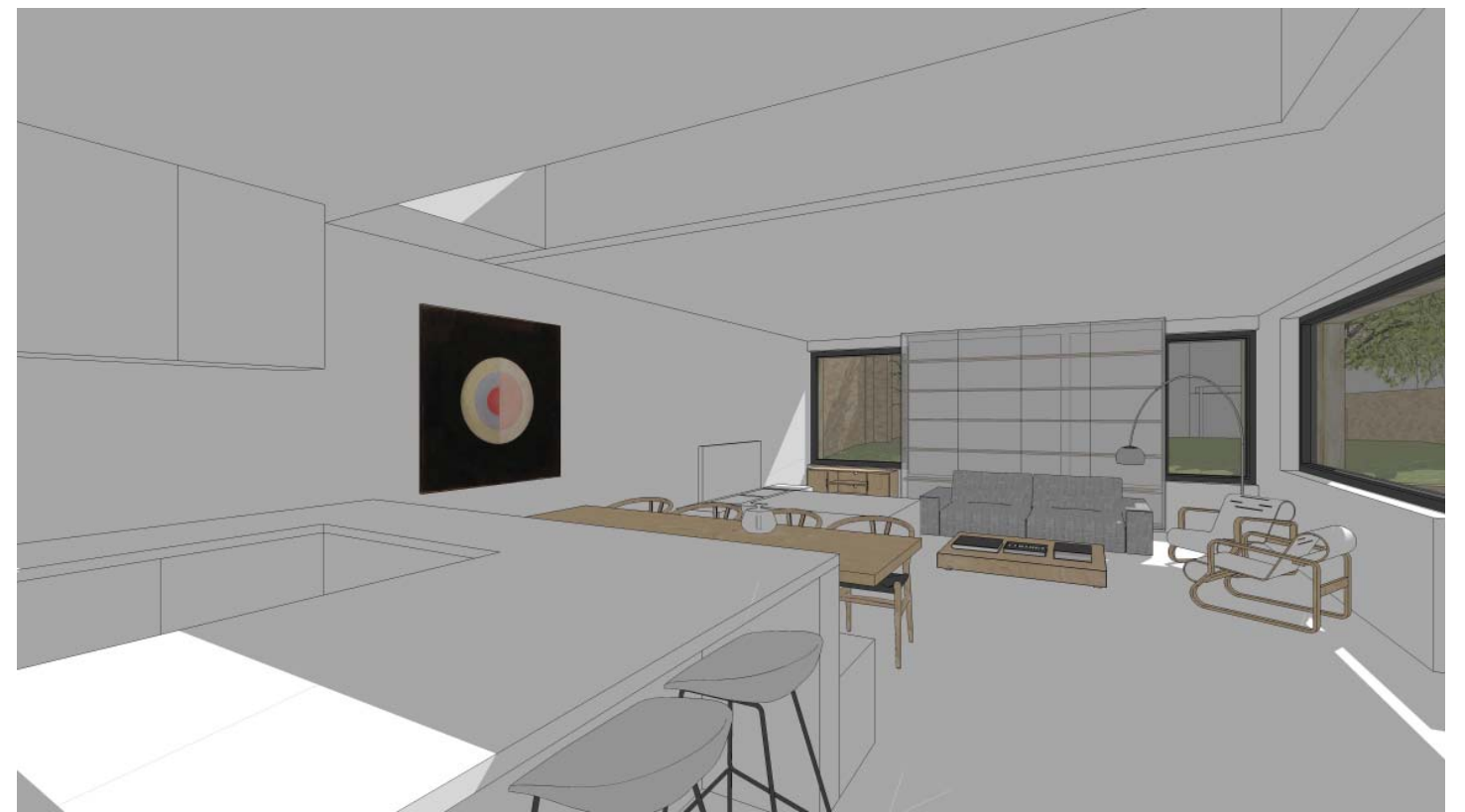
B. View of the ground floor living room and kitchen, showing the space future use as a ground floor disabled accessible apartment for Max's wife, Taddy.