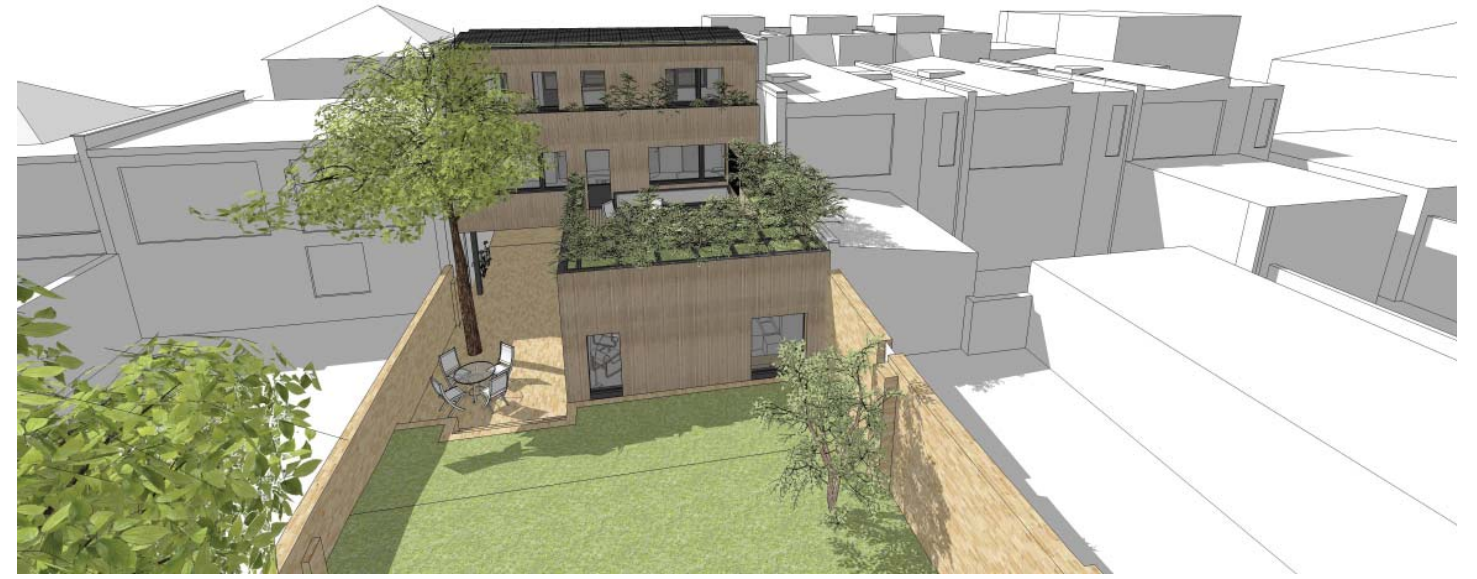
B. View from the upper storeys of 3 Camden Square, showing set back partial third storey with plantings in front.