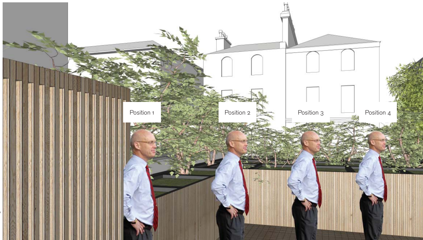
C. View from the first floor balcony looking towards 5 Camden Square's garden showing figures which are present in the Model of image D too.