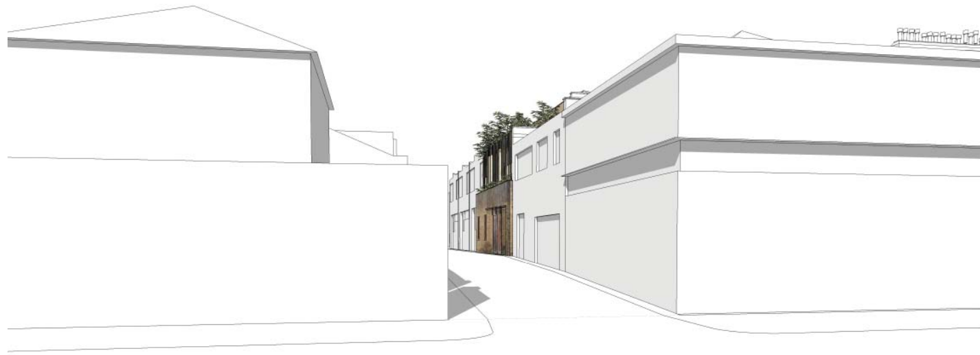
C. View looking north from Murray Street, showing the minimal visual impact of the partial third storey.