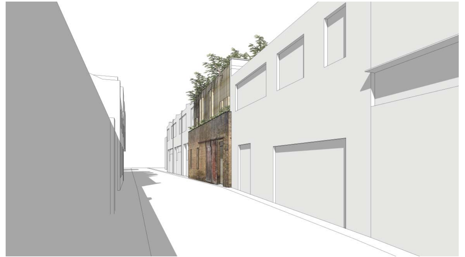
B. View looking north along Camden Mews, showing the two storey visible massing green roof plantings softening the streetscape