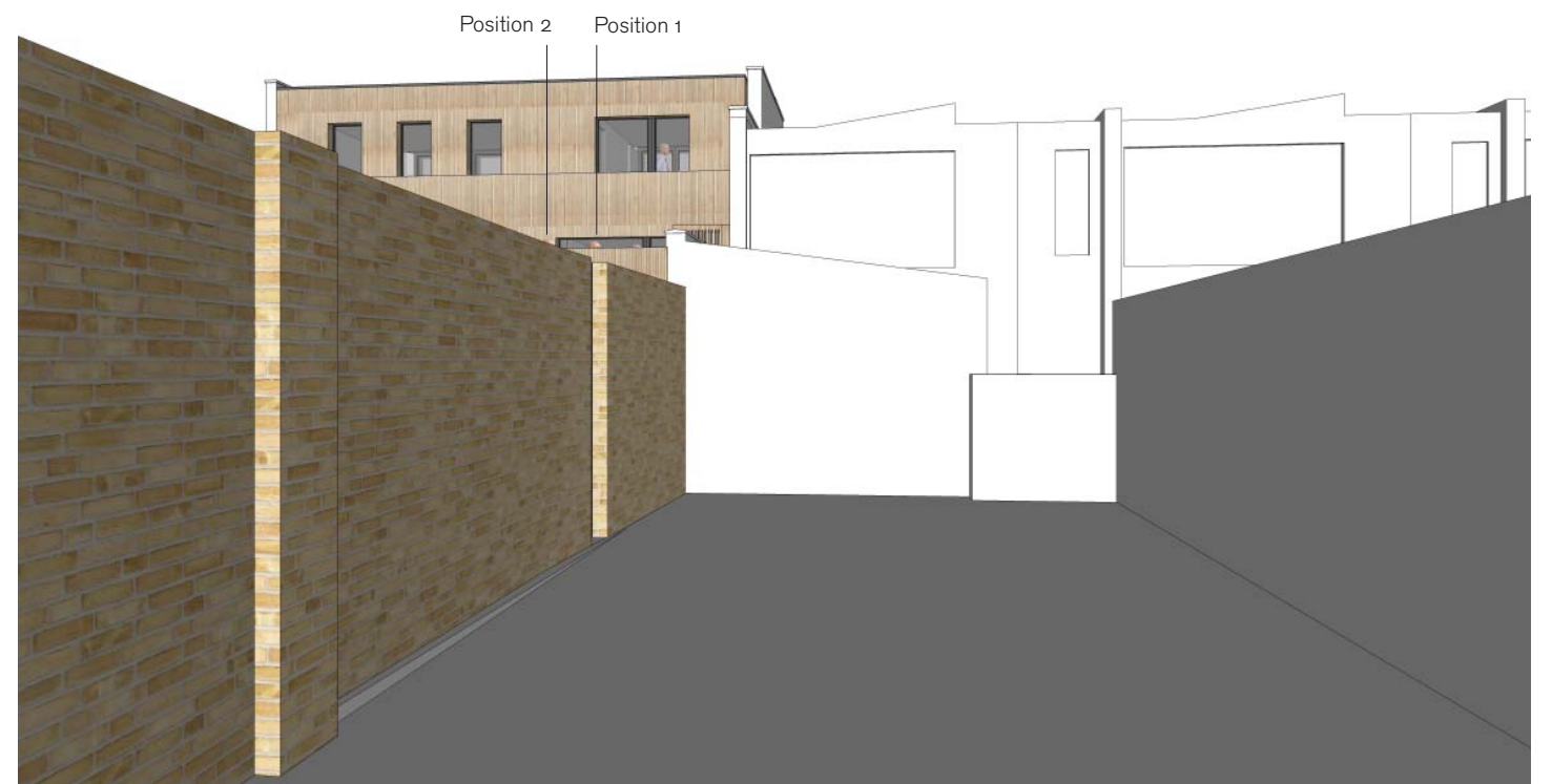
D. View from the garden of 5 Camden Square's garden looking towards 6 Camden Mews showing how there is no overlooking as the figures are hidden behind the enlarged planter, even without plants in it.