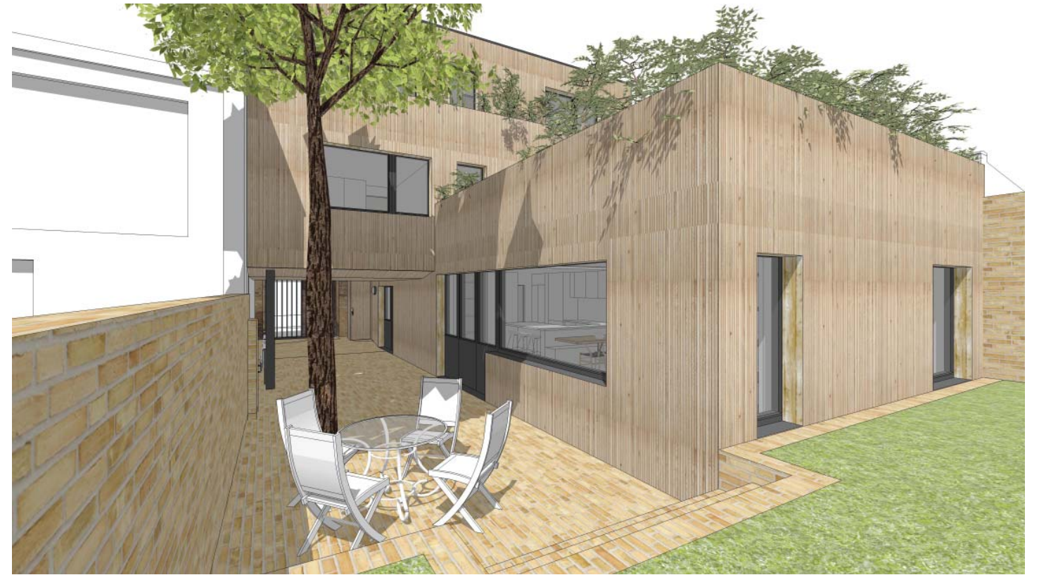
D. View from the garden of 3 Camden Square towards Camden Mews, showing the rear ground floor volume reaching into the garden to gather more sunlight.