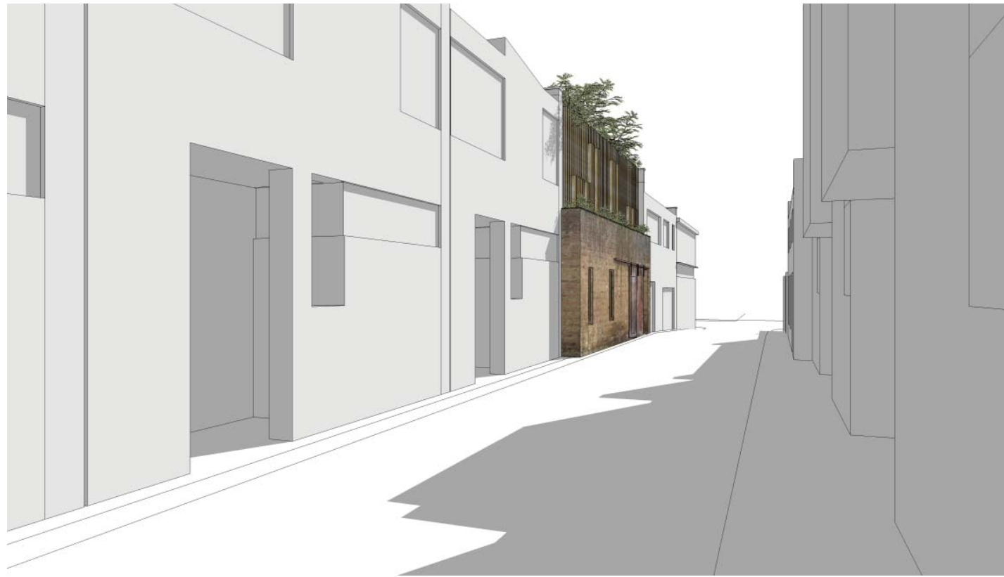
A. View looking south along Camden Mews, showing the two storey visible massing green roof plantings softening the streetscape