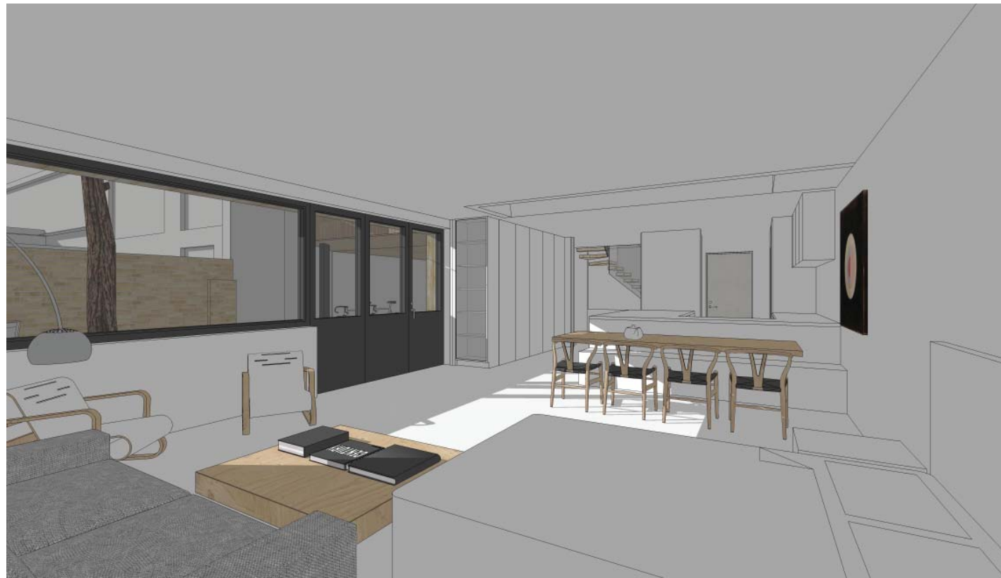
A. View of the ground floor living room and kitchen, showing the space future use as a ground floor disabled accessible apartment for Max's wife, Taddy.