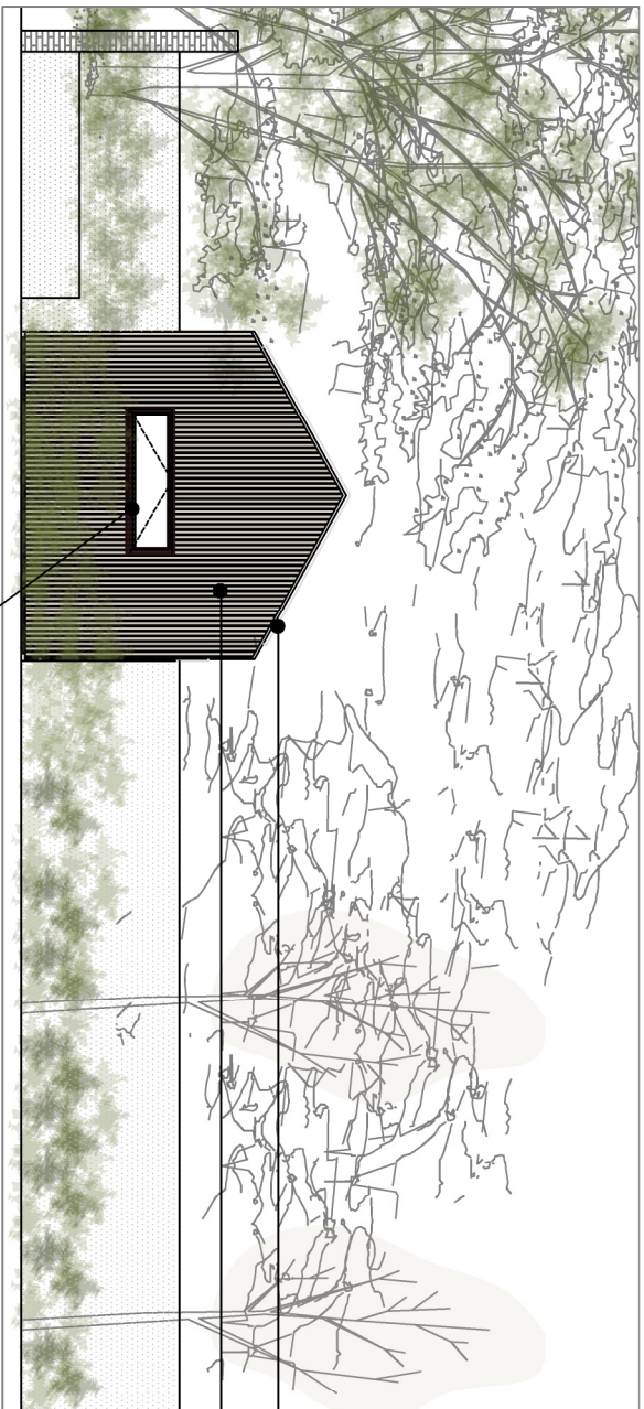
EAST ELEVATION SCALE 1:100